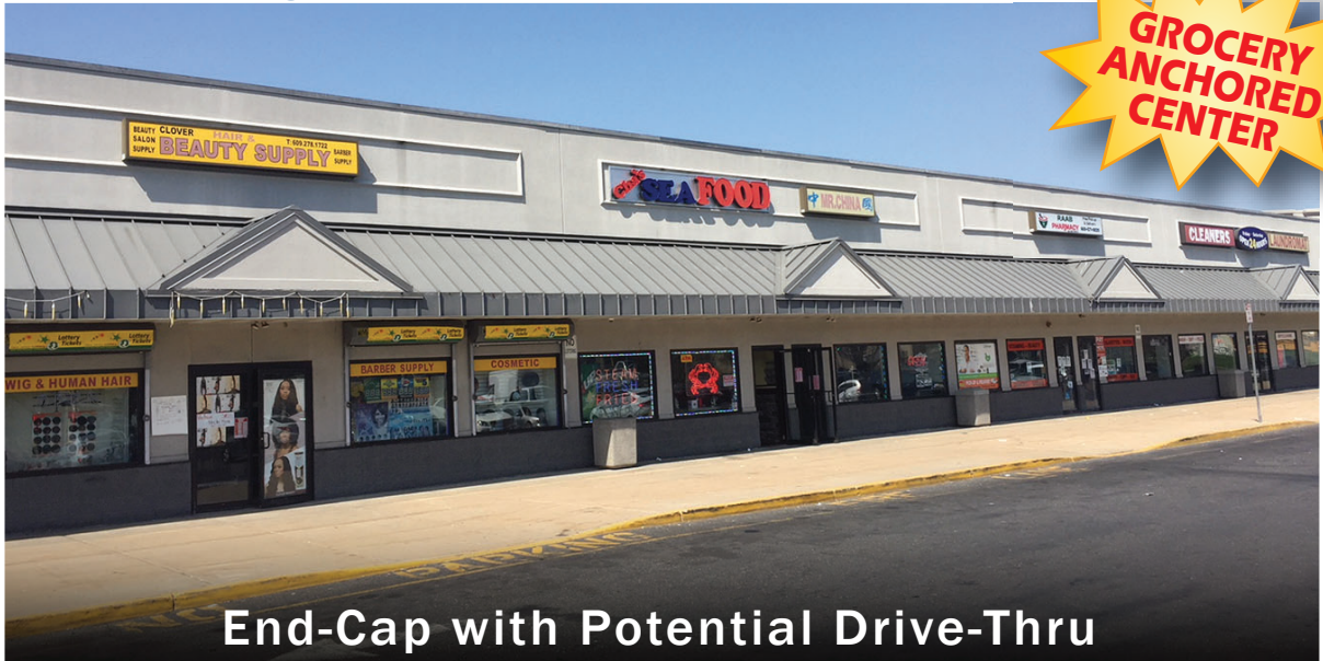
End-Cap with Potential Drive-Thru