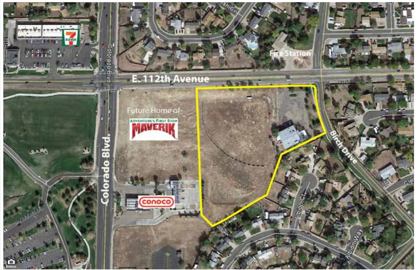
Boundaries shown as a visual reference only and may not be accurate. Consult broker for complete legal description.

11155 Birch Drive, Thornton, Colorado 80233