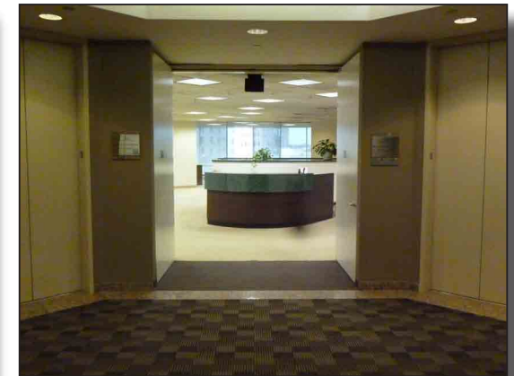
Lobby Entrance into Suite 710

2237 Douglas Boulevard, Suite 100, Roseville, CA 95661 • 916.772.8648 • 916.848.0205 Fax • Lic #01333376 | www.voitco.com