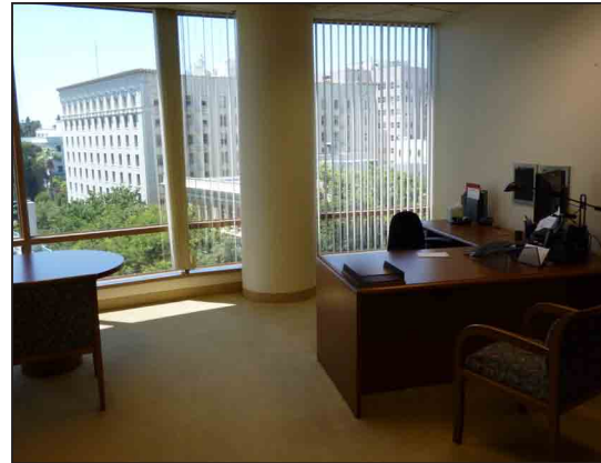
Sample Office Furniture