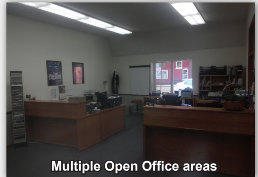
Multiple Open Office areas