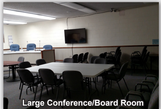
Large Conference/Board Room