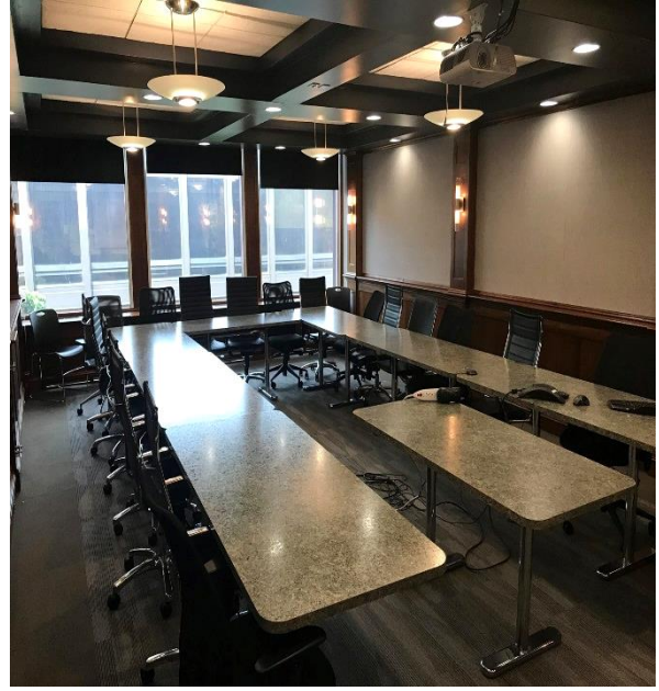
Common Conference Room