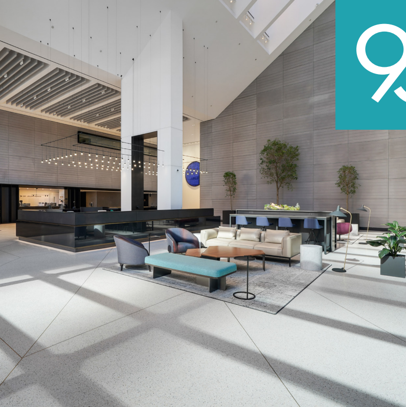
Expansive new lobby with generous circulation areas