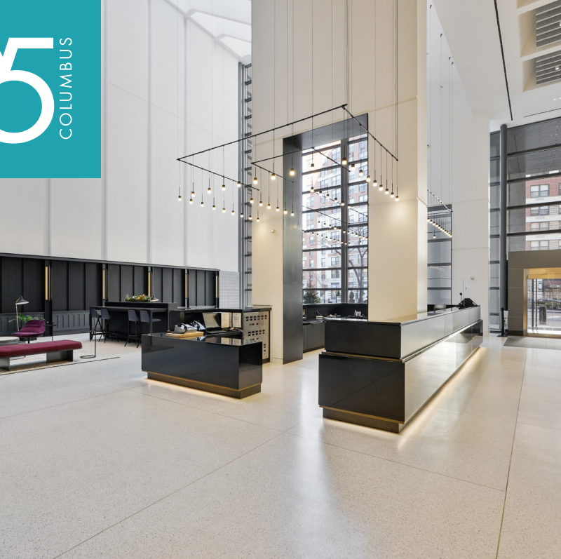
Enhanced security and complete digital access boosts efficiency and productivity

95 Columbus in Downtown Jersey City has undergone a full lobby renovation, new common areas, elevators and a bike room with shower facilities.