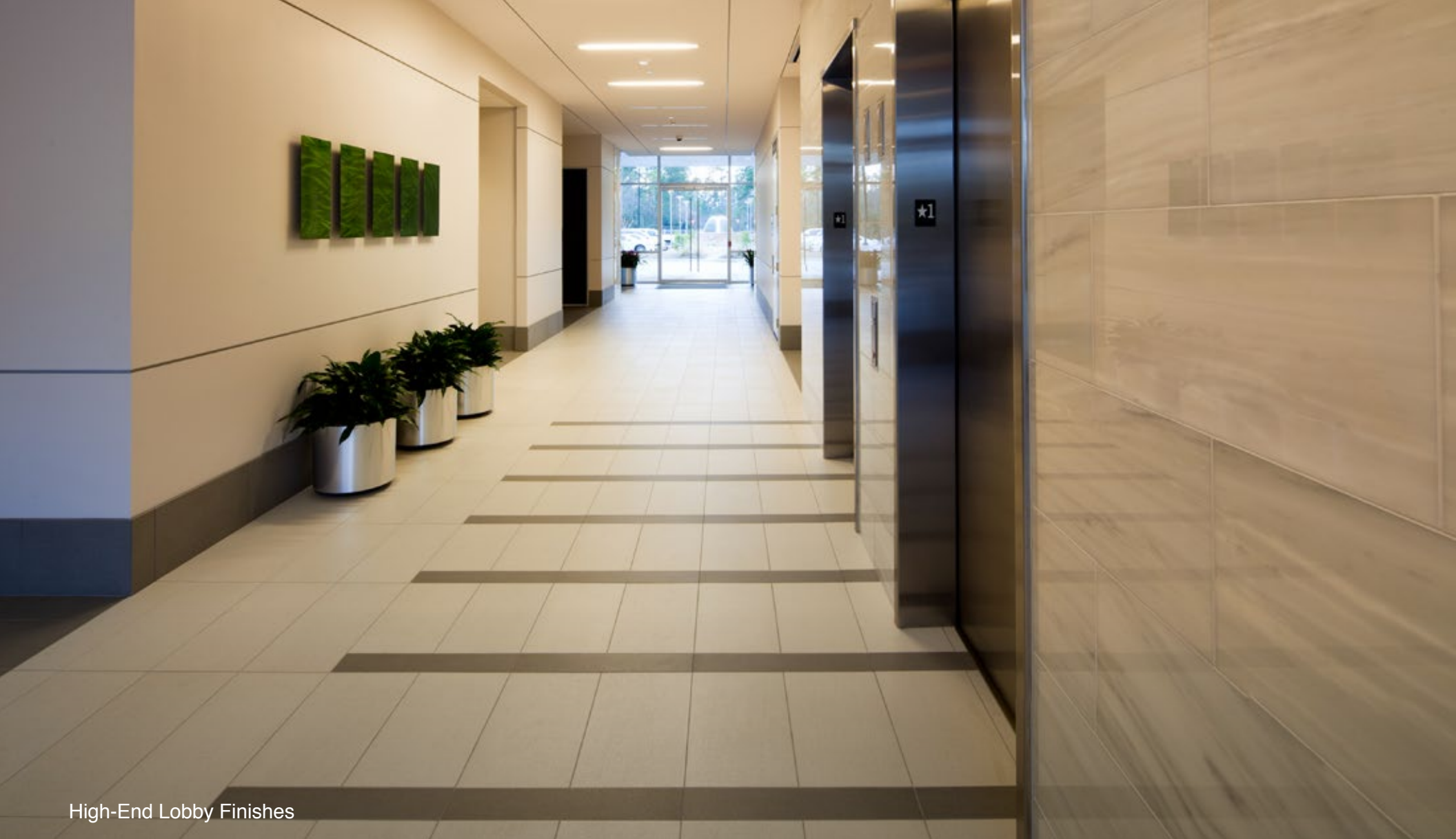
High-End Lobby Finishes