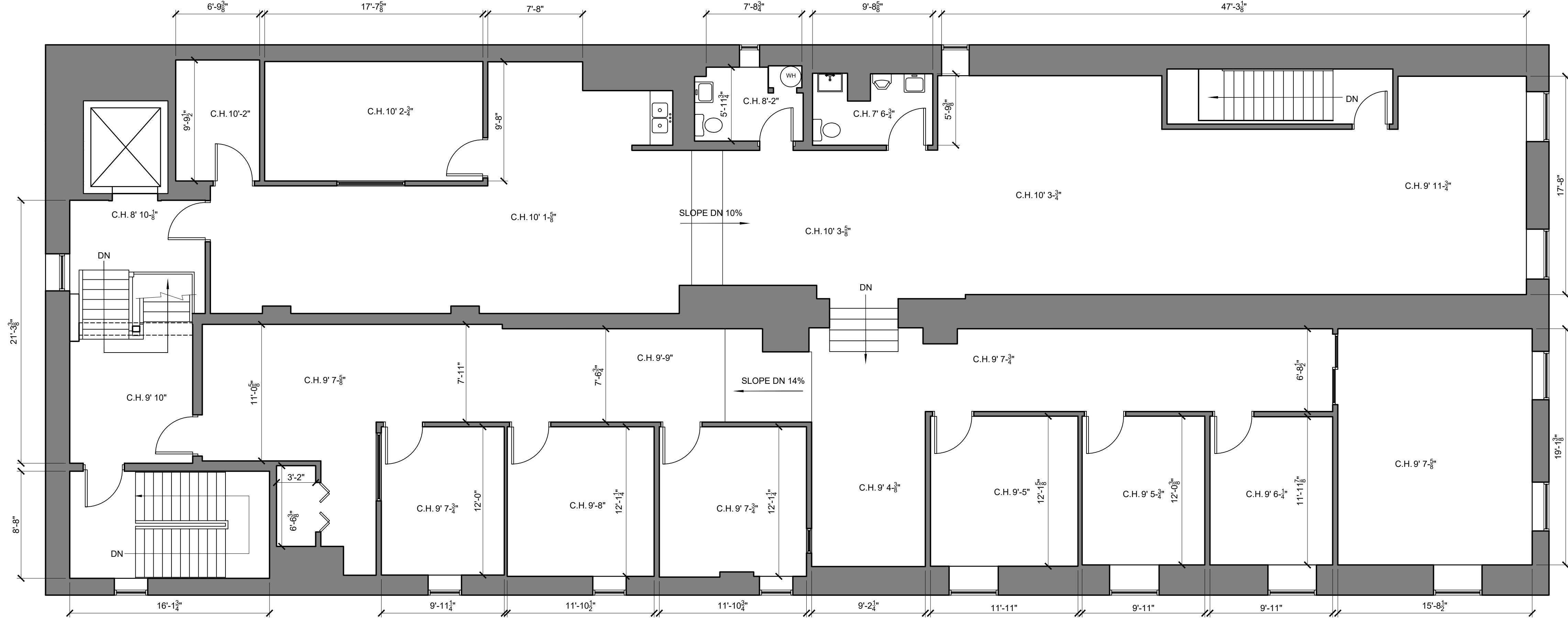
1 EXISTING SECOND FLOOR PLAN 3/6"=1'-0"