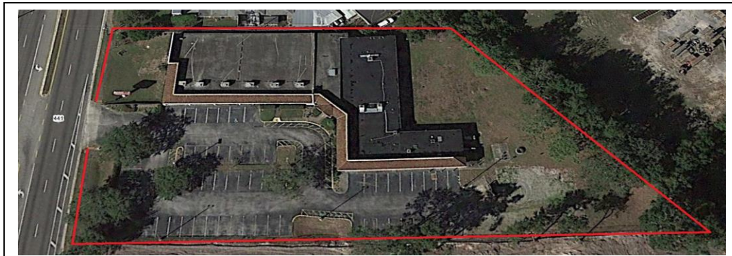
This information is from sources we deem reliable and is subject to prior sale, lease, withdrawal without notice, or change in prices, rates, or conditions. No representation is made as to the accuracy of any information furnished.