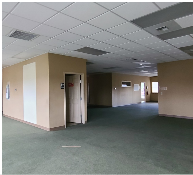
Warranty: Goodale & Barbieri Company does not guarantee, warrant, either expressed or implied, any information supplied by the Seller. Buyer should rely on his own verification of this information as a part of their own due diligence. Copyright: We respect the intellectual property of others. If you believe that your work has been copied in a way that constitutes copyright infringement please contact us immediately.

Goodale & Barbieri Company 818 West Riverside #300 Spokane, WA 99201 www.g-b.com