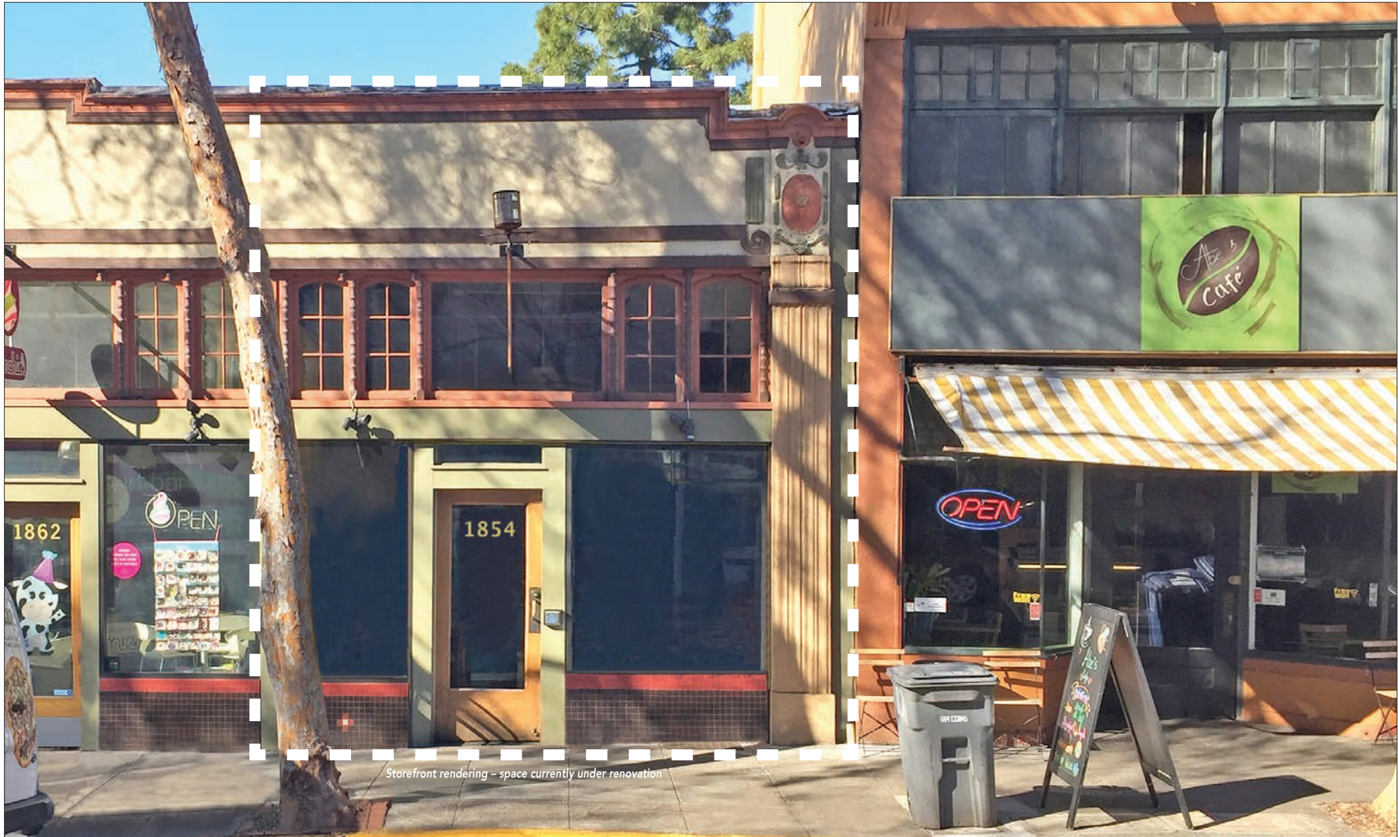
Storefront rendering – space currently under renovation

TREMENDOUS DAILY FOOT TRAFFIC AT UC BERKELEY'S NORTH GATE