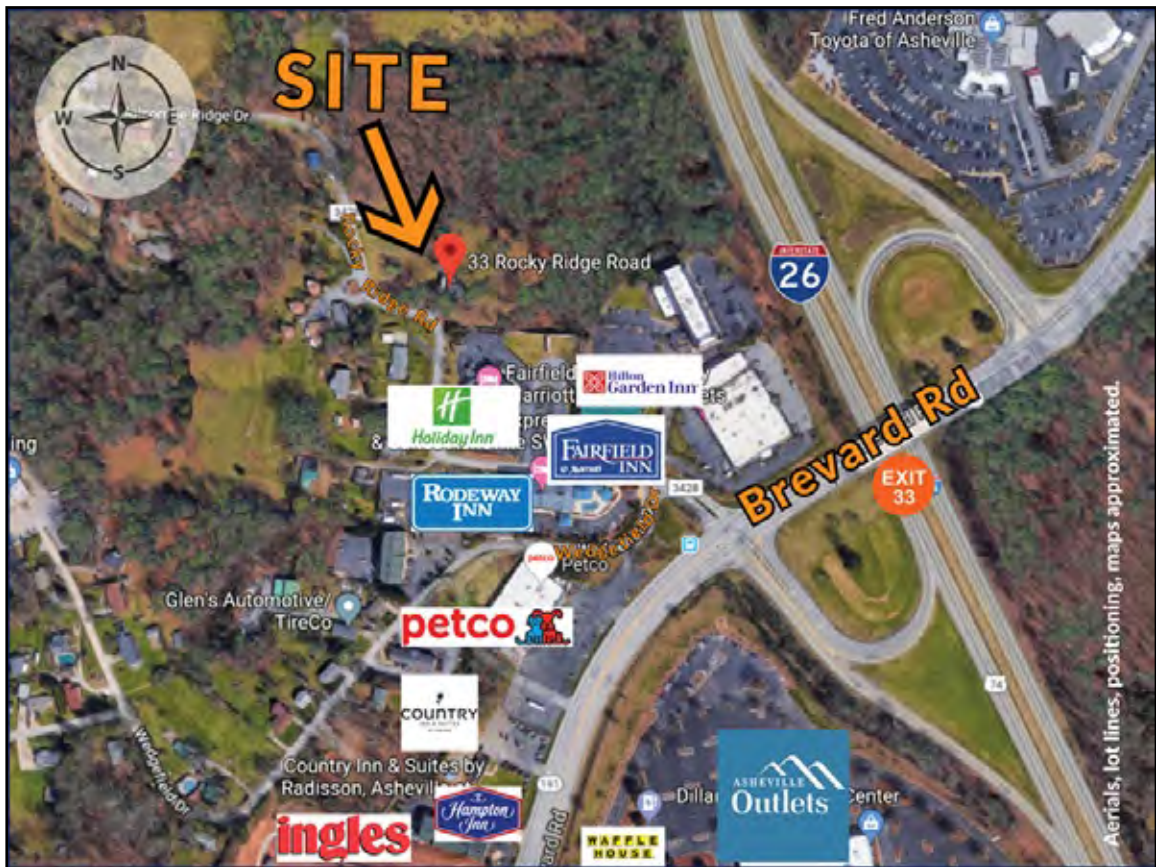
Many of the businesses in proximity to the site