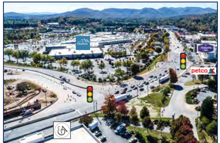
Upper photo: Site; Lower photos: View of Freeway access, and Brevard Road Corridor