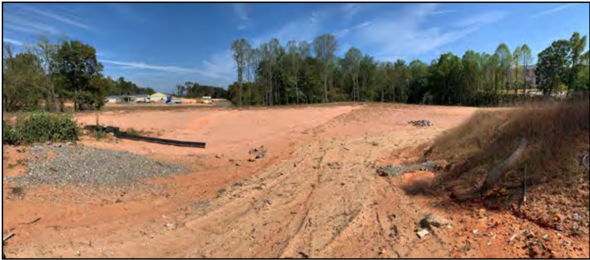
Site is pad-ready - view from the East