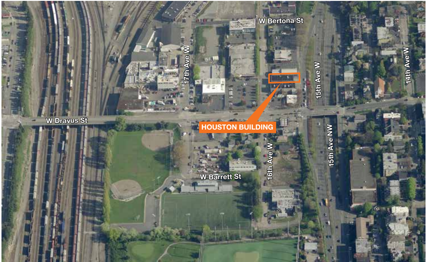
1ST FLOOR WAREHOUSE