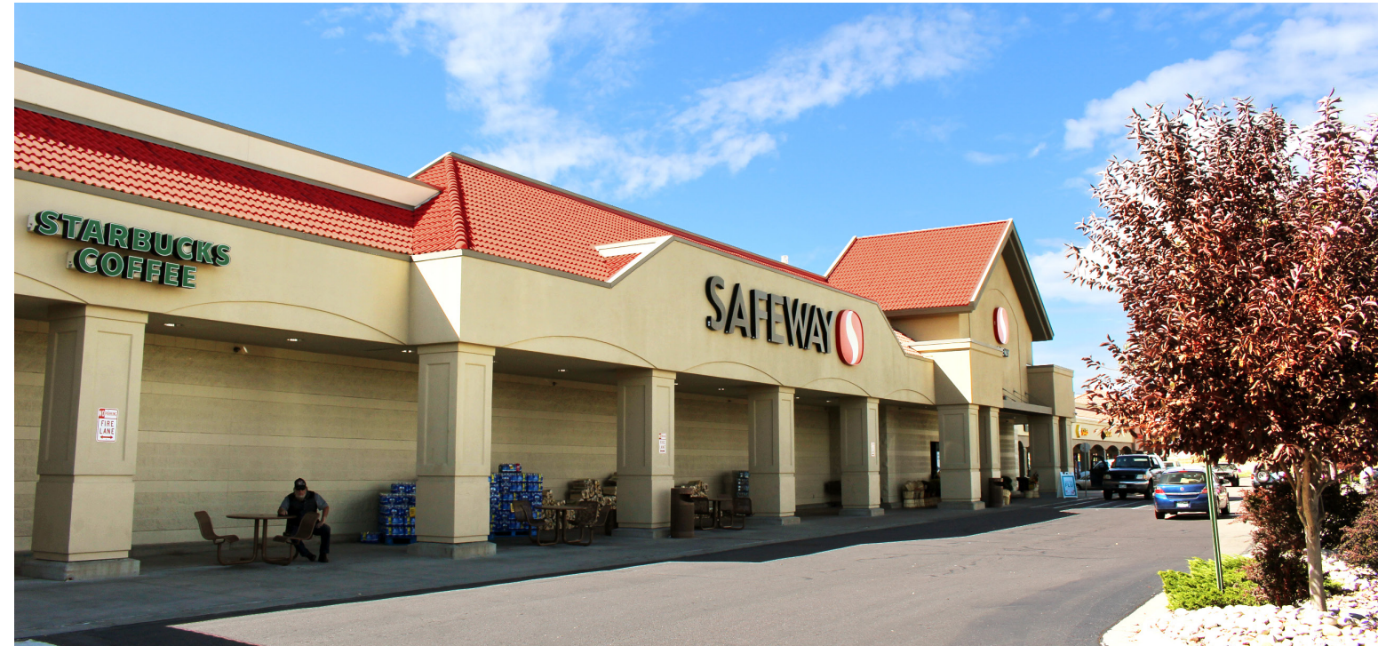
65,418 SF CLASS A RETAIL CENTER