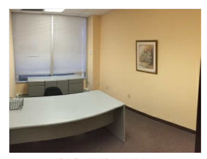
Fully Furnished Suites Available