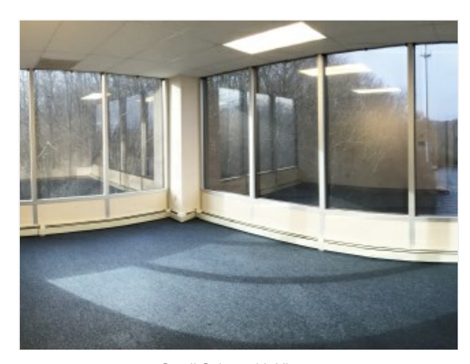
Small Suites with Views