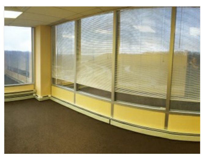
Small Suites with Views

◆ Plug & Play Exec. Office, Private Suites, Flex Cubicles ✓ Fully Furnished or Unfurnished Options ✓ IT Architecture and Support Options ✓ Phone, Internet, Copy, Kiosk Services ✓ Conference Rooms and Event Areas ✓ Identity / Signage Available ◆ Scalable Data Center Services ✓ Cabinets, Cages, or Private Suites ✓ Network Attached Storage ✓ High & Low Density Options ✓ Carrier Neutral Site ✓ Cloud Storage and Backup