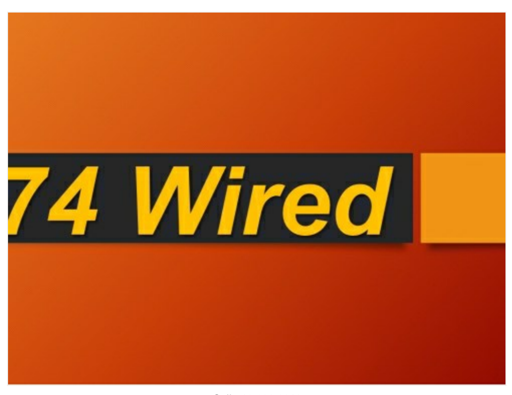
Data Center / Colocation Space