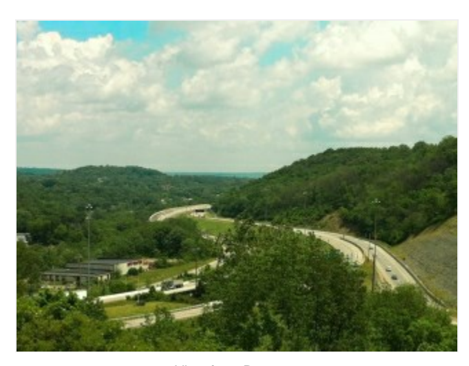
View from Property