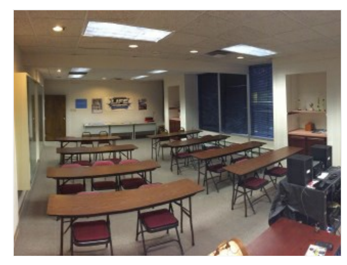
Training and Event Space