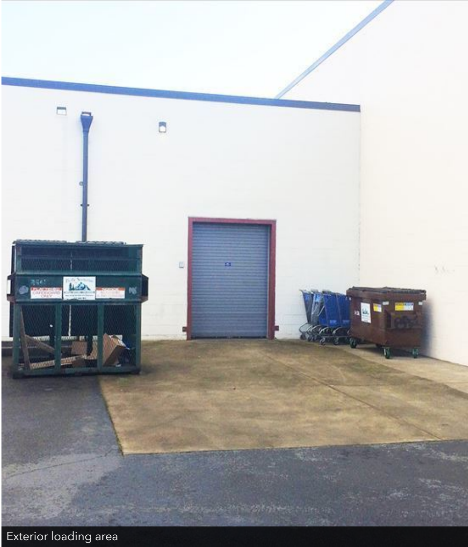
Exterior loading area