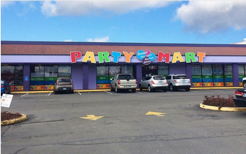
Front of building