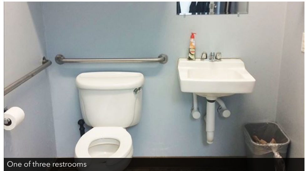
One of three restrooms