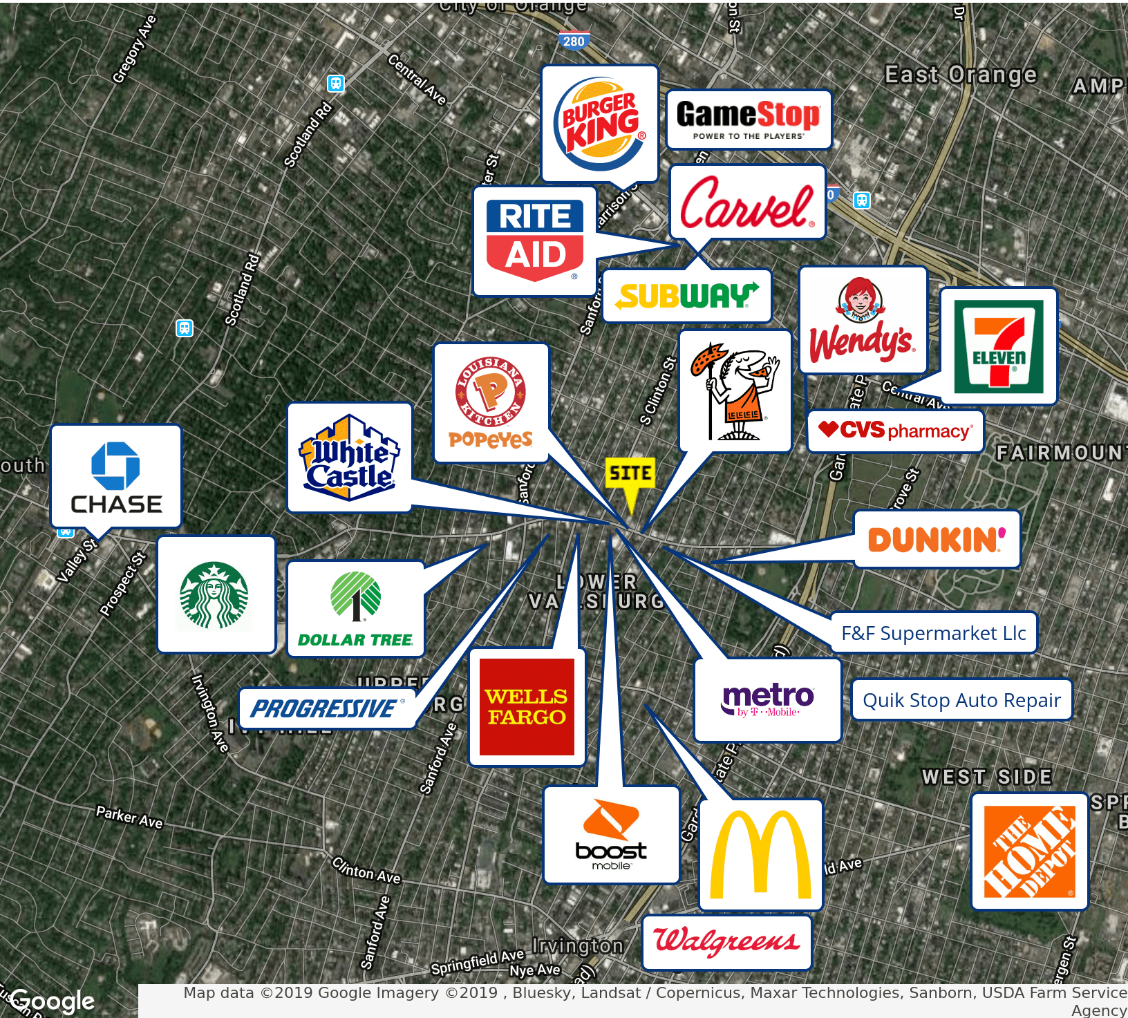
Map data ©2019 Google Imagery ©2019 , Bluesky, Landsat / Copernicus, Maxar Technologies, Sanborn, USDA Farm Service Agency

907 SOUTH ORANGE AVENUE, EAST ORANGE, NJ 07018