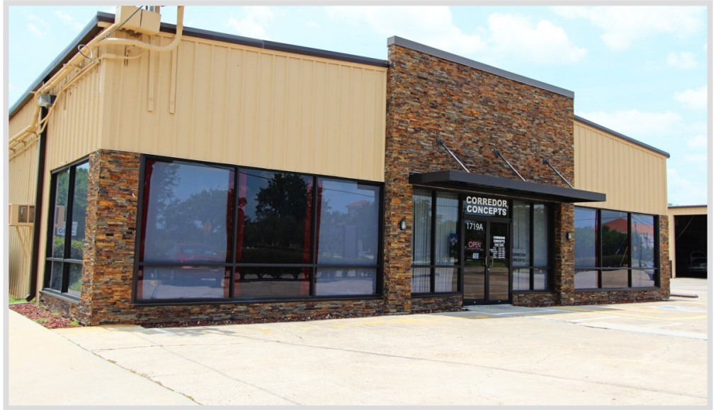
Recently remodeled exterior

Larry Indermuehle, CCIM (281) 207-3701 lindermuehle@icotexas.com