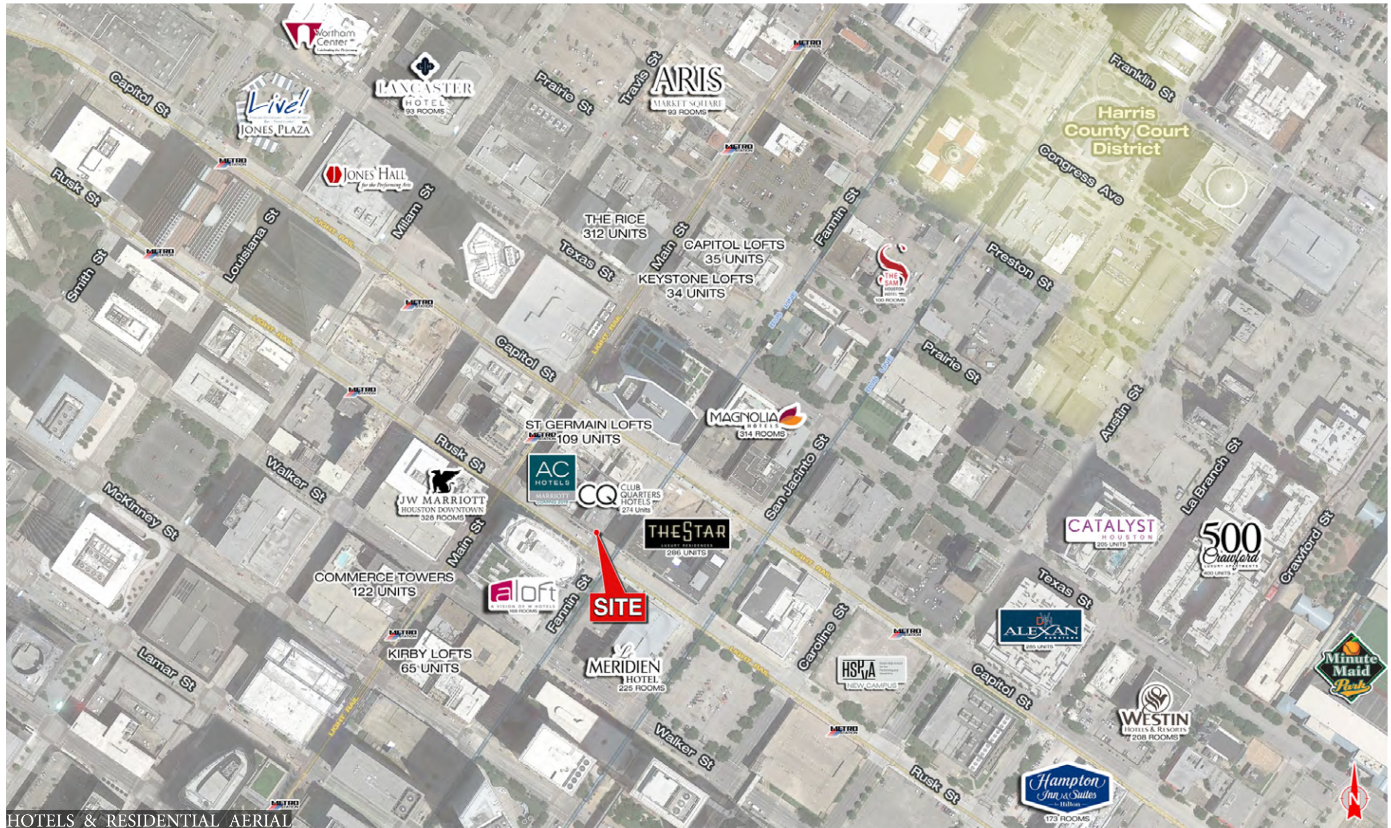
HOTELS & RESIDENTIAL AERIAL