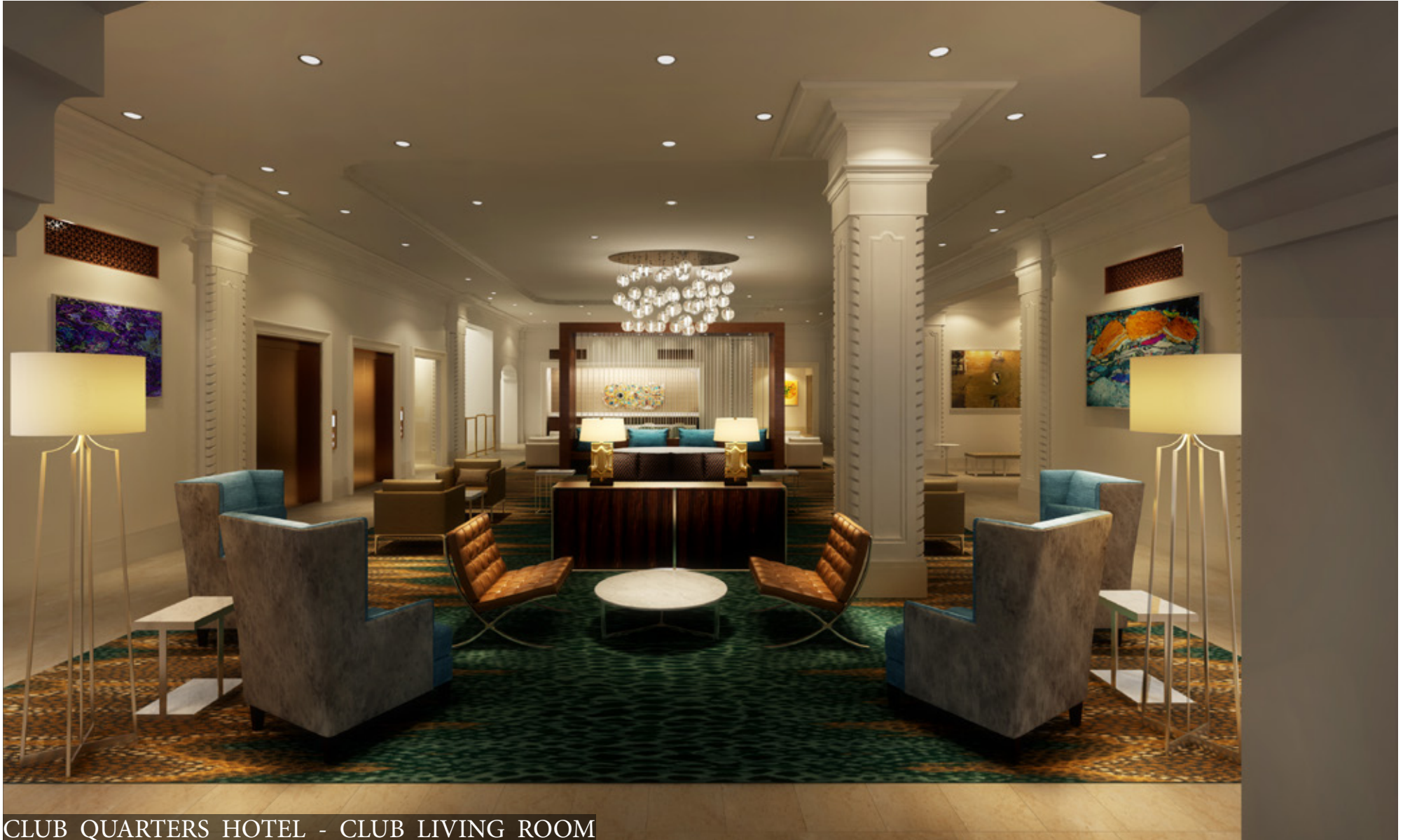
CLUB QUARTERS HOTEL - CLUB LIVING ROOM