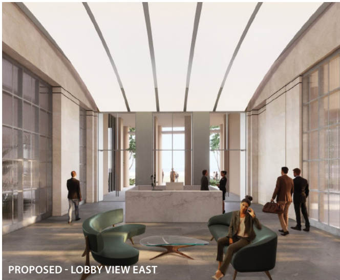
PROPOSED - LOBBY VIEW EAST