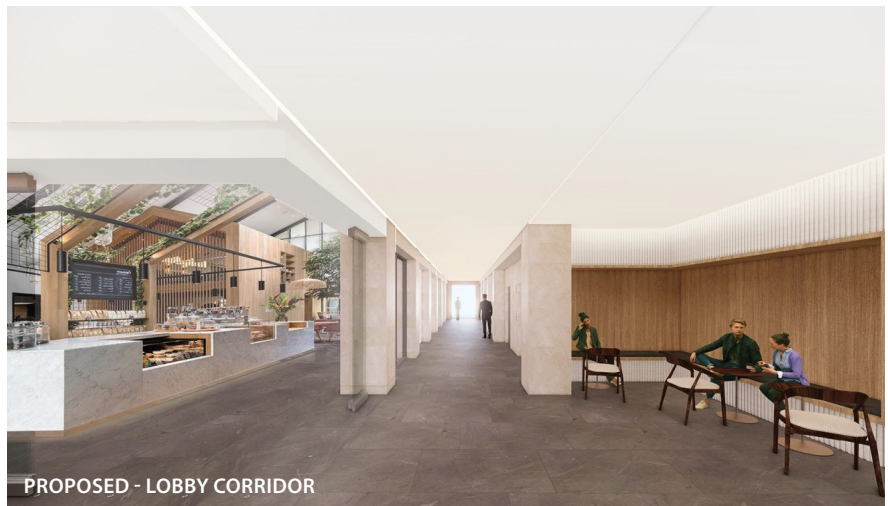
PROPOSED - LOBBY CORRIDOR