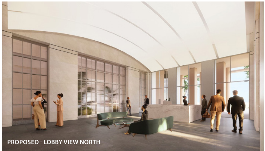
PROPOSED - LOBBY VIEW NORTH