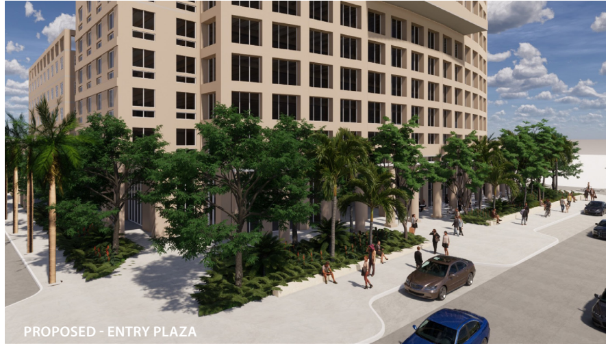
PROPOSED - ENTRY PLAZA