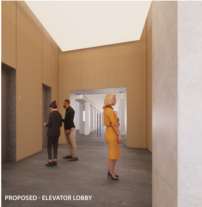
PROPOSED - ELEVATOR LOBBY