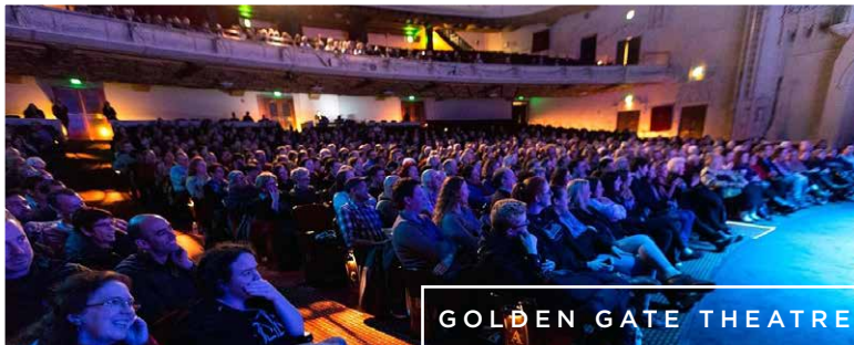
GOLDEN GATE THEATRE