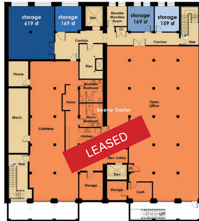
2ND FLOOR (MAIN)