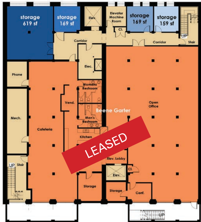
1ST FLOOR (LOWER LEVEL)