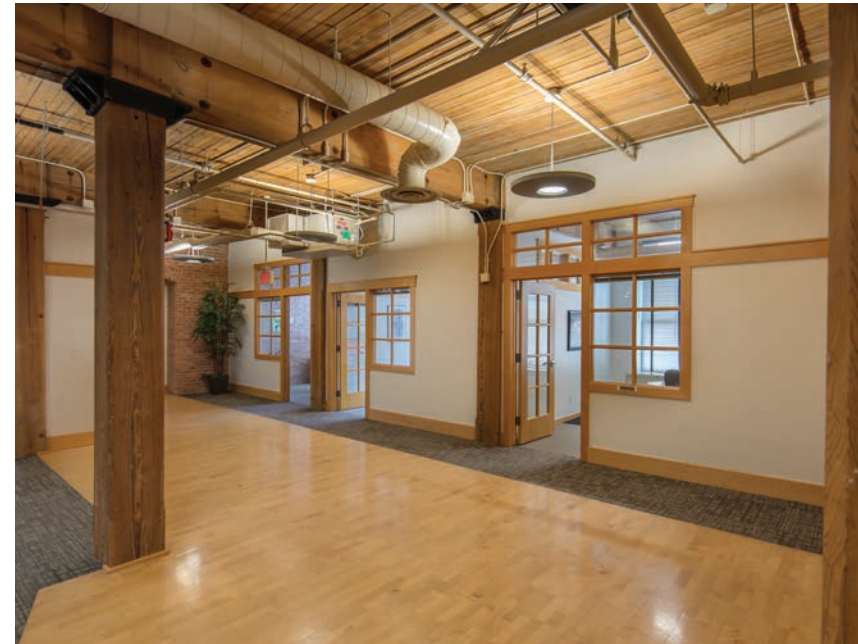
27 private glass door and sidelite window offices bring in an abundance of natural daylight