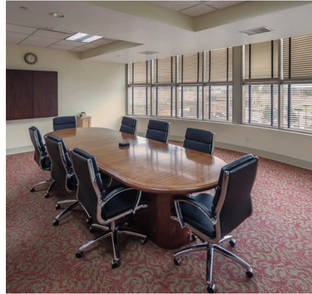
Private rooms of various sizes present limitless workspace opportunities