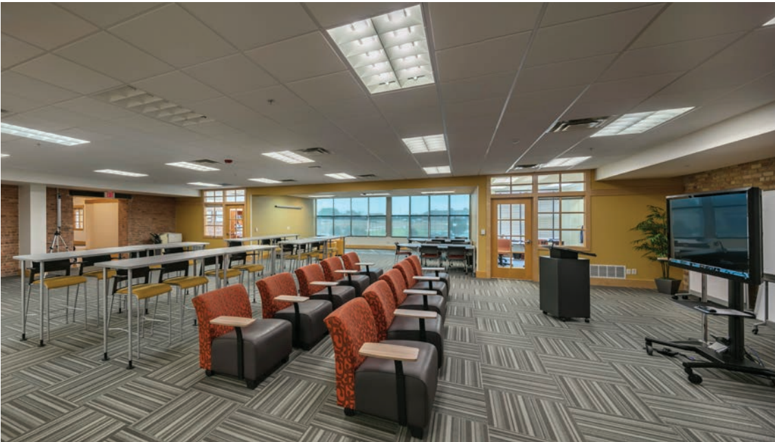
With 30,000+ square feet, there is plenty of room for large presentation spaces and open-office concepts