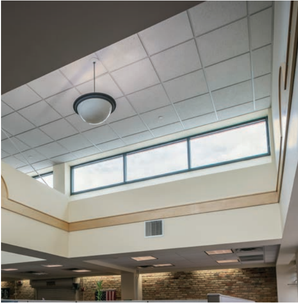
This unique 4th floor skylight welcomes ample daylight into your space