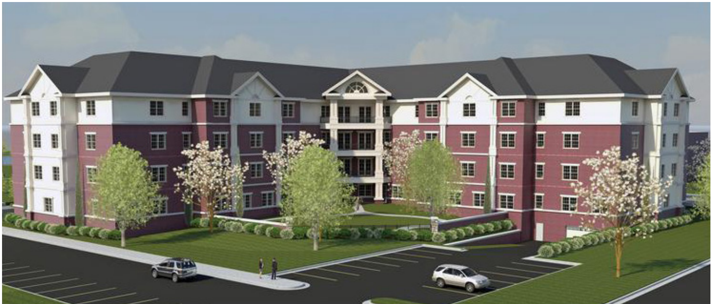
SENIOR LIVING (29 UNITS PER ACRE)