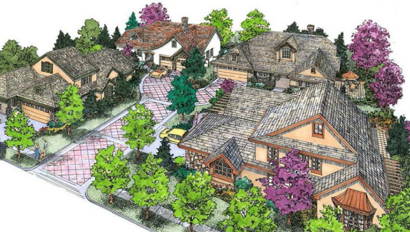
ATTACHED SINGLE FAMILY