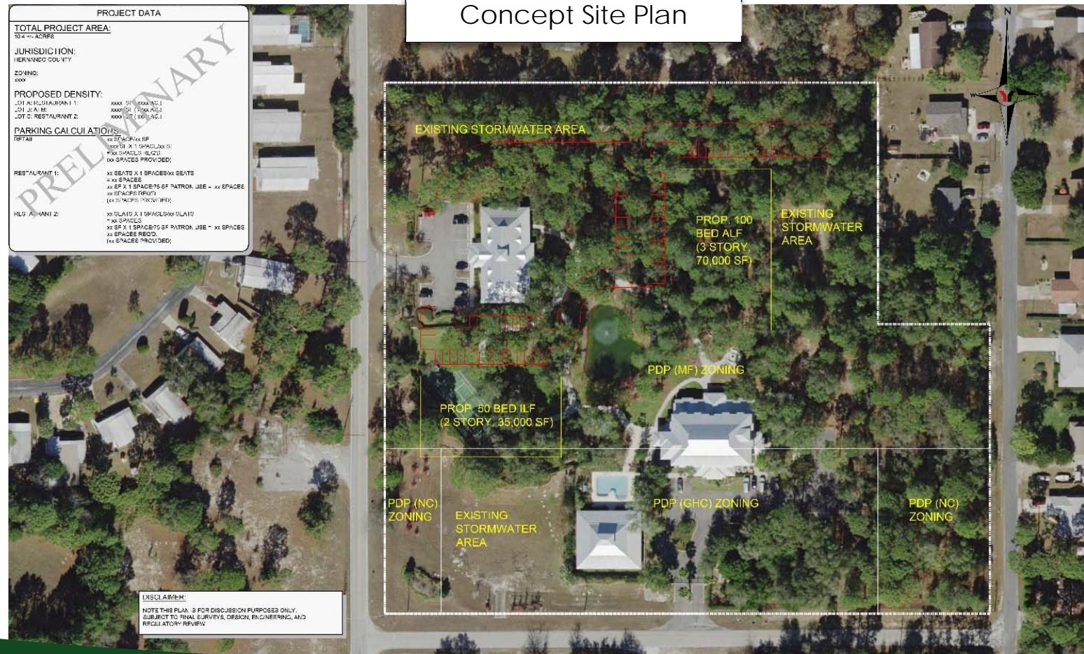
Concept Site Plan