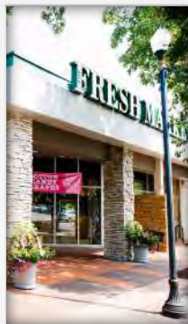
GROCERY: FRESH MARKET