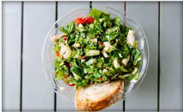
FAST CASUAL: CHOPT