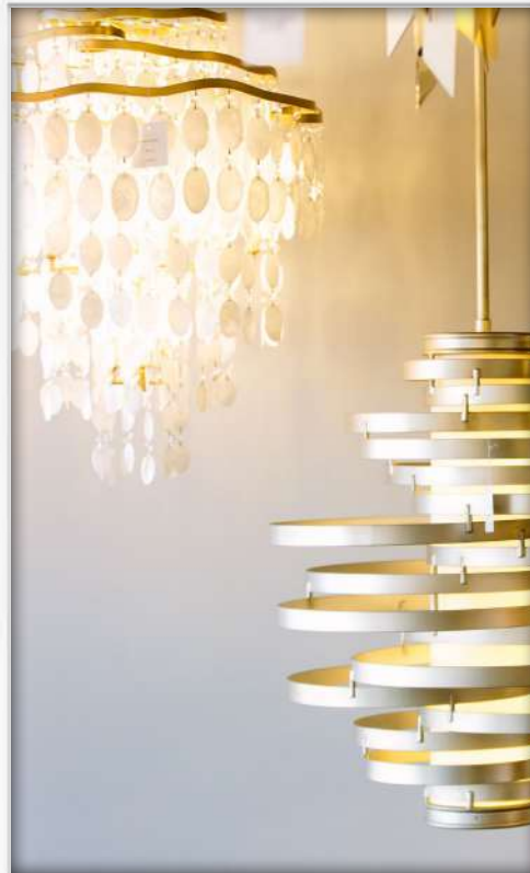
HOME DECOR: CAROLINA LIGHTING & DESIGN