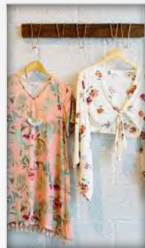
RETAIL: BELLA MAR