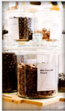
GROCERY: HARRIS TEETER