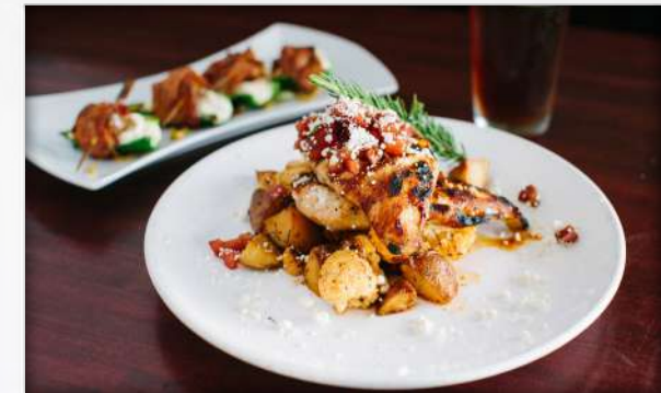
TABLE SERVICE RESTAURANT: TAZZA KITCHEN