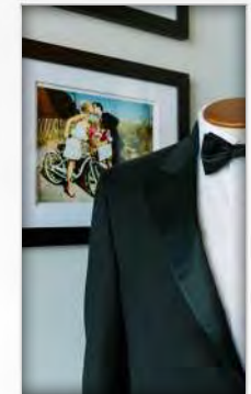
RETAIL: ALTON LANE