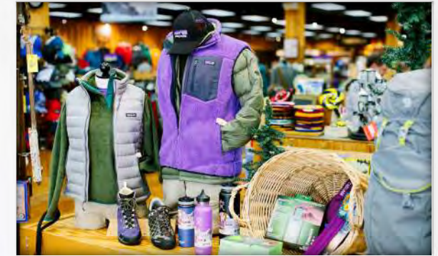
RECREATION: GREAT OUTDOOR PROVISION CO.