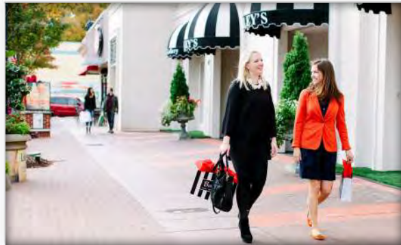
JEWELRY: BAILEY'S FINE JEWELRY

Regional and national best-in-class merchants create an experience unlike any other. Cameron Village delivers chic, cool, authentic merchants where you want to shop.