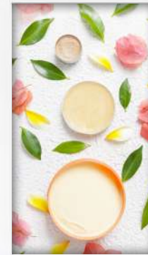
HEALTH & BEAUTY: AILLEA