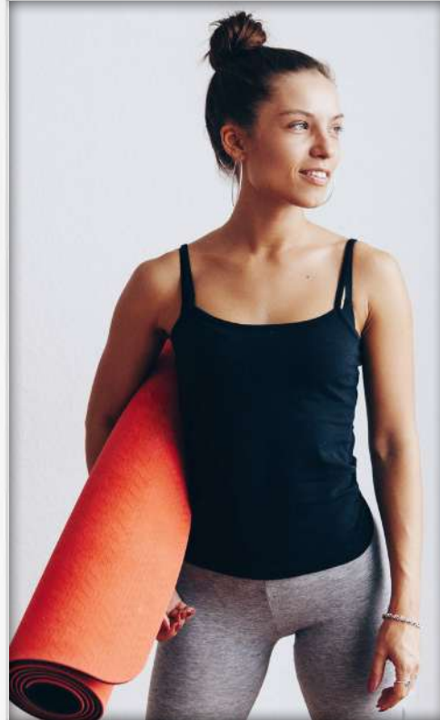
FITNESS: COREPOWER YOGA