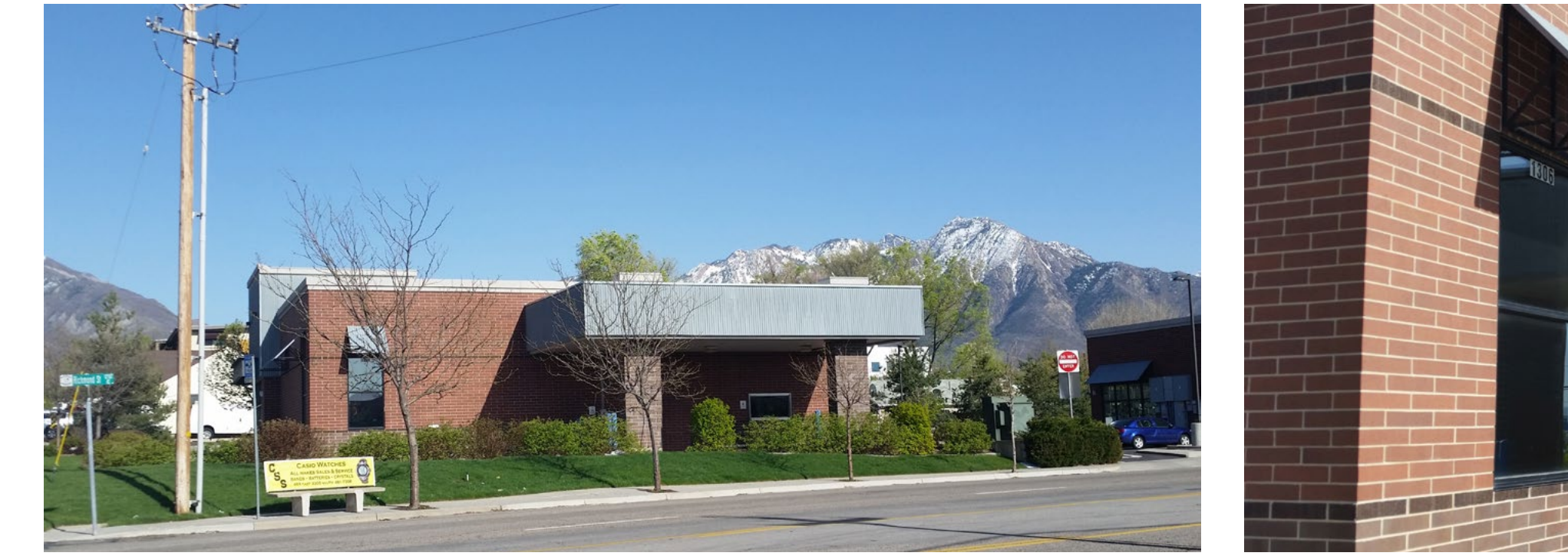
West Side of Building: Excellent visibility from Richmond Street and Harmons.

1306 East Woodland Avenue Millcreek City, 84106