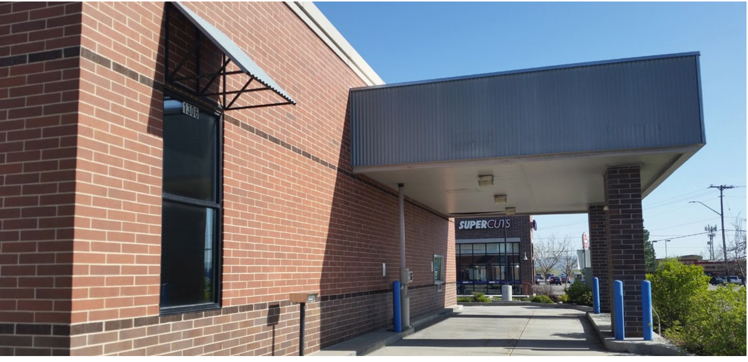
Covered Patio Area: Garage roll up door could be installed to create a covered patio area.