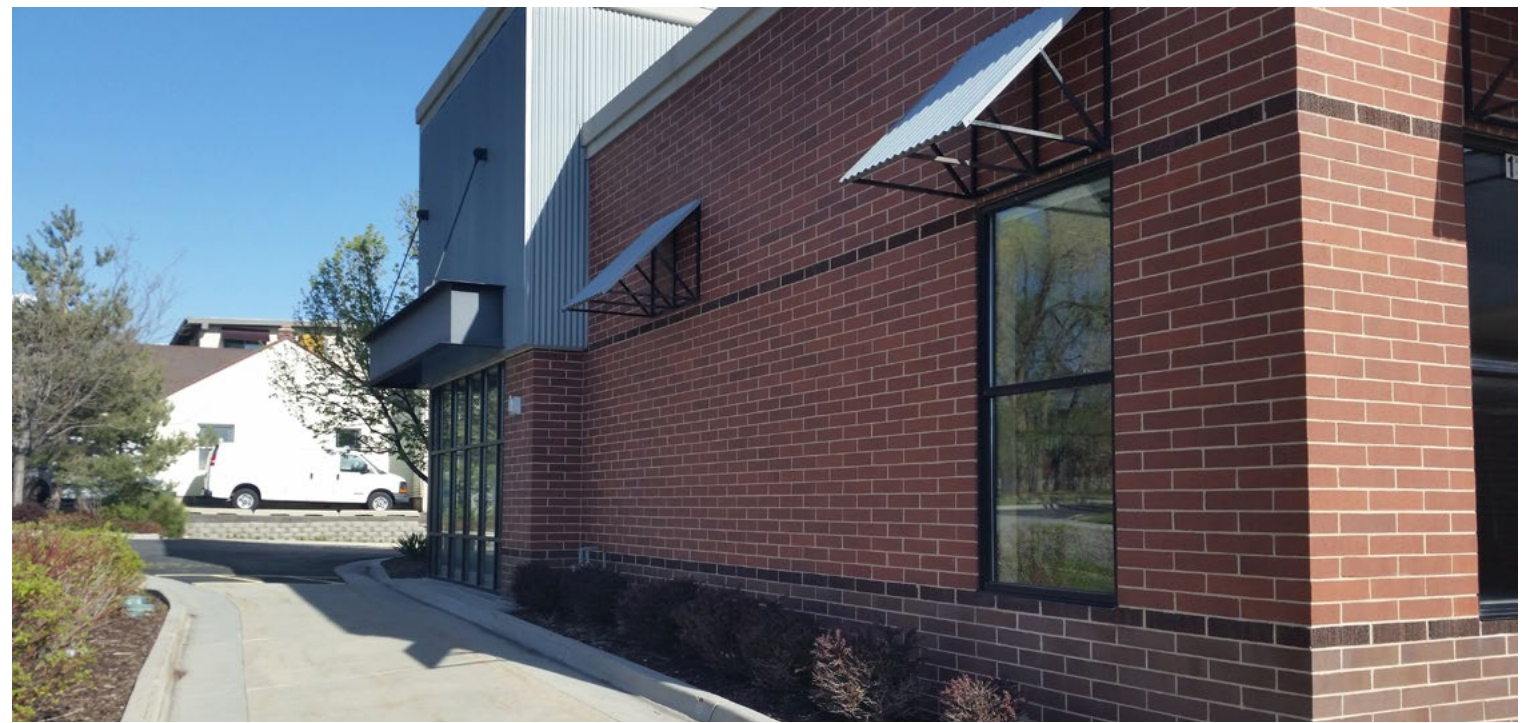
East Side of Building: Could be converted to a patio area.