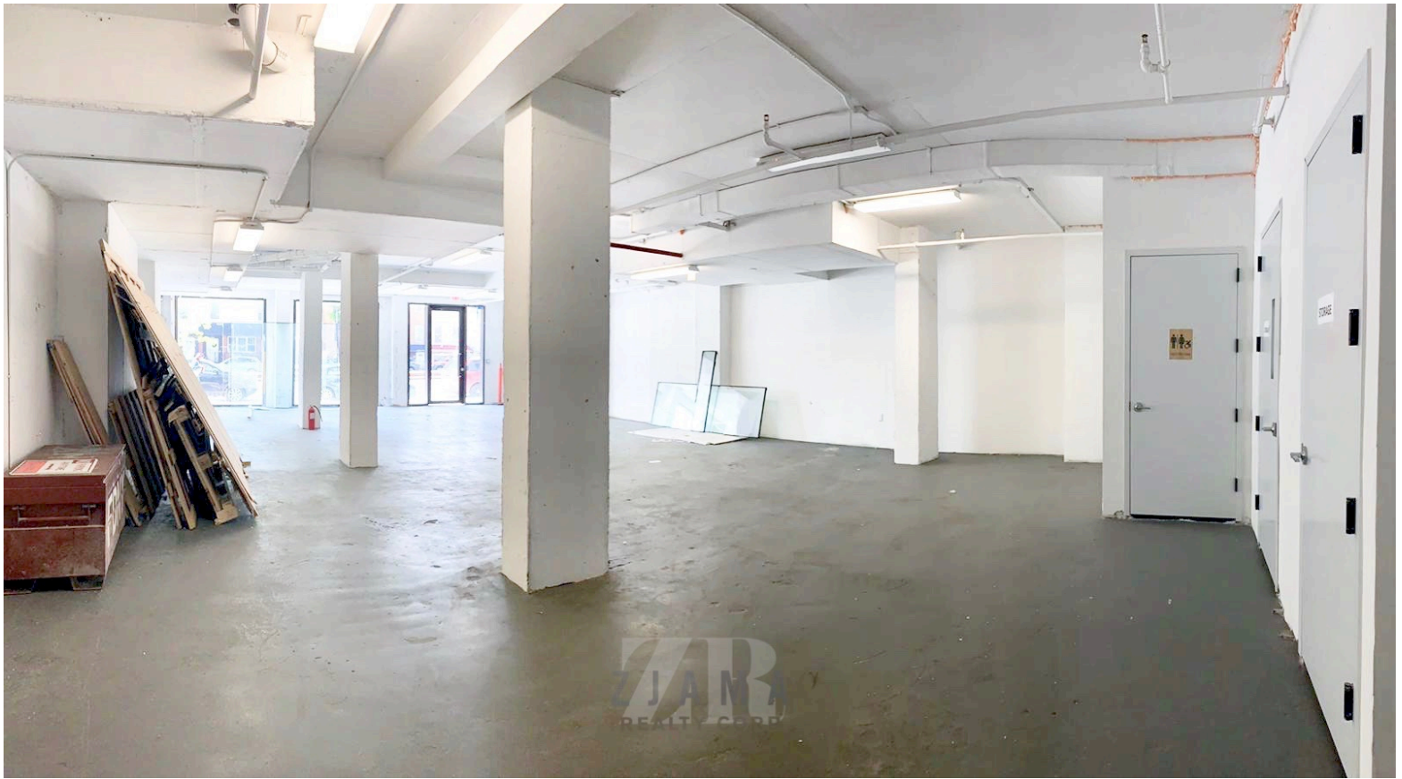
Big & spacious open view plan