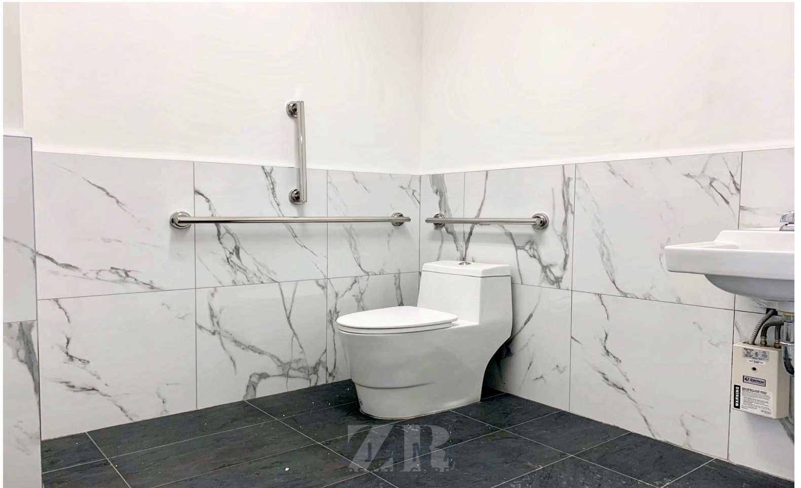
ADA compliant brand new beautiful bathroom