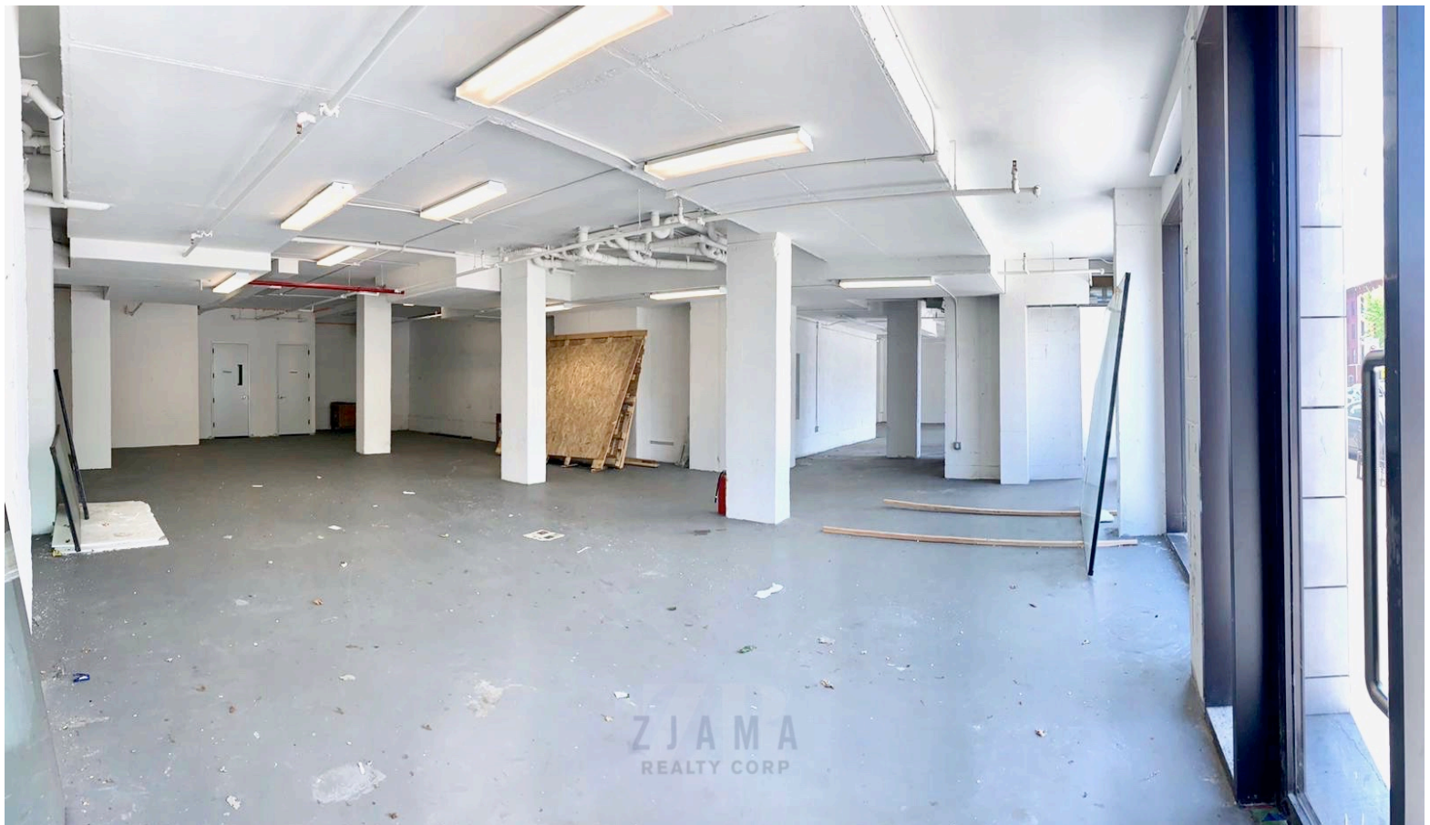
Big & spacious Passage to other space