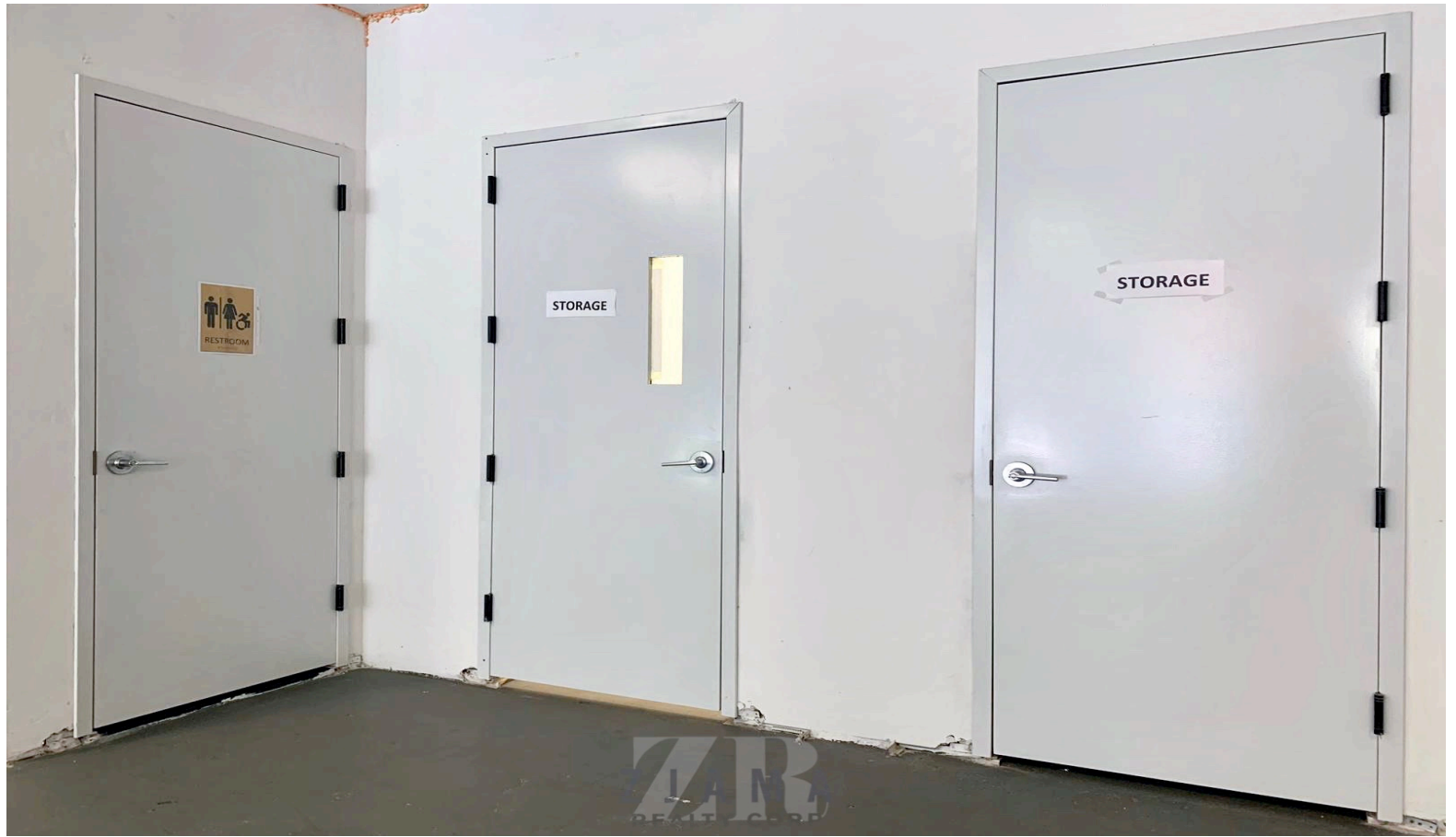
Storage space in the back of the store