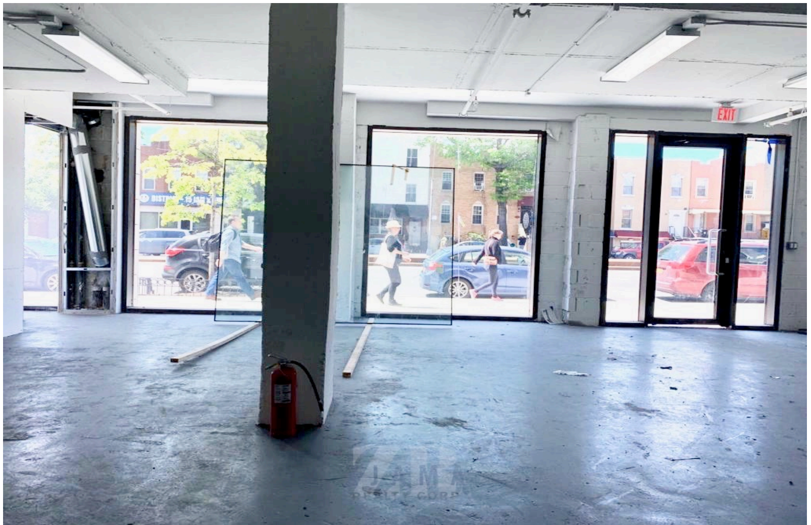
Store Front window- fluent foot traffic