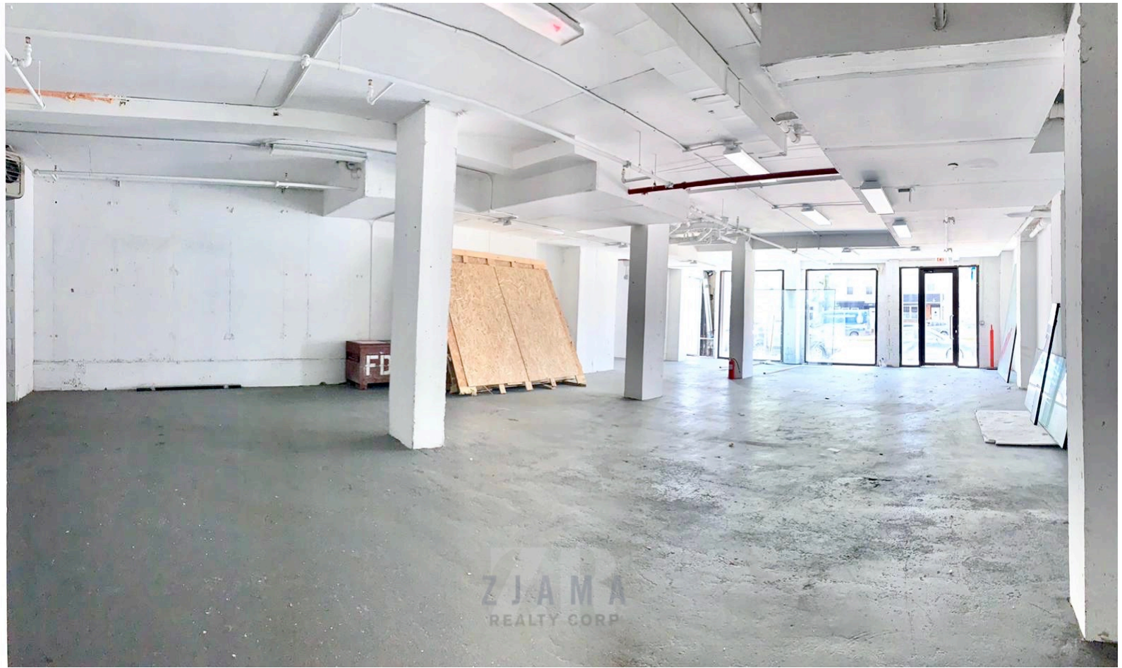
Fabulous sunlight throughout the whole floor