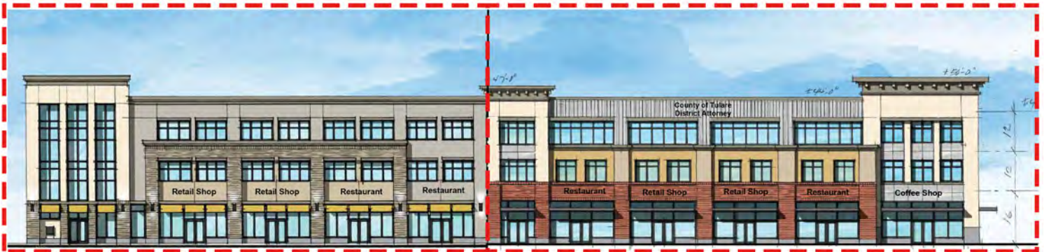
Overall North Main Street Elevation SCALE: 3/32=1'-0"

All projections, opinions, assumptions or estimates are supplied for example only, and may not represent current or future performance of the property. Any and all information pertaining to location, demographics and the site plan is supplied by sources believed to be reliable. We do not guarantee the accuracy of information and make no warranty or representation thereto. All information is presented here with the possibility of errors, omissions, change of price, rental or other conditions, prior sale, lease or financing, or withdrawal without notice. Commercial Retail Associates operates under the corporate Department of Real Estate License #01121565.