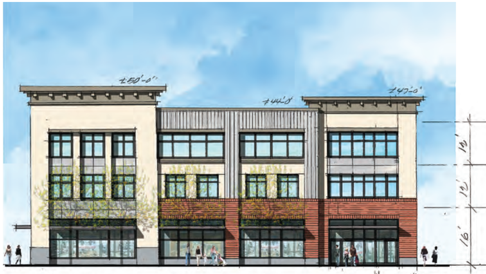
Olive Avenue Elevation SCALE:3/32=1'-0"