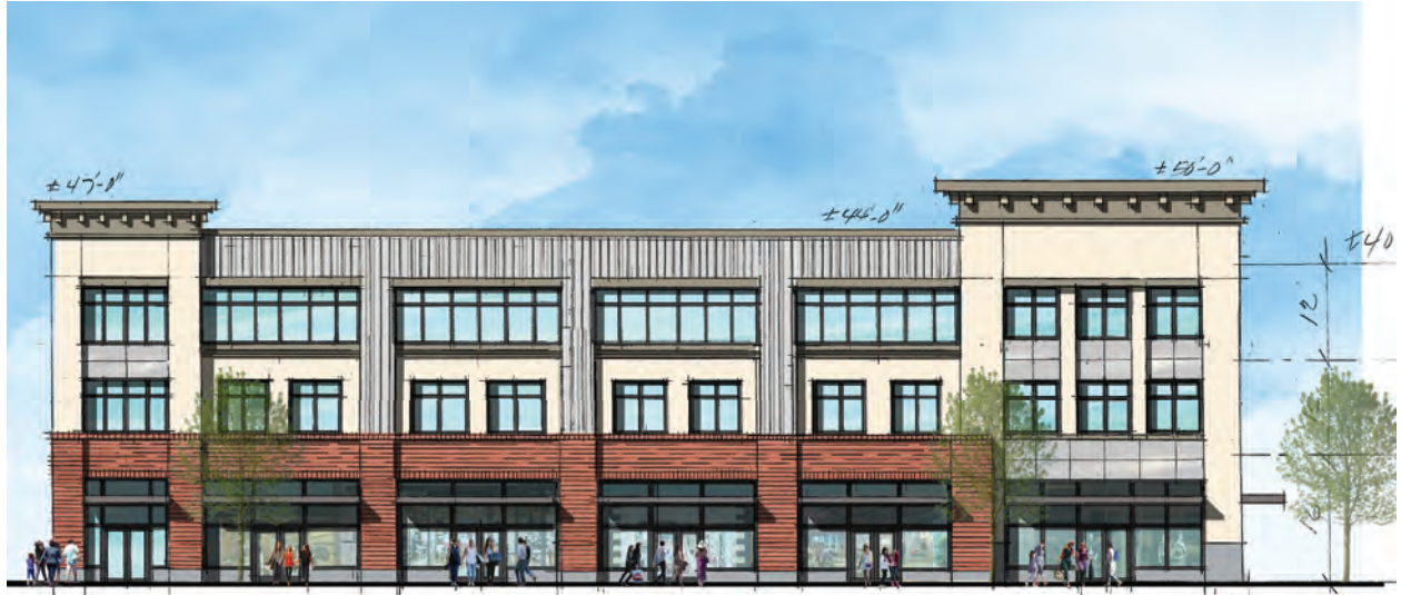
NEC of North Main Street Elevation SCALE:3/32=1'-0"