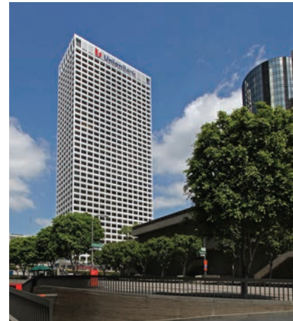
Union Bank Plaza Los Angeles, California