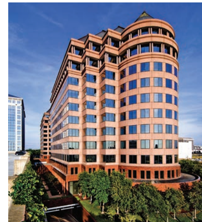
Providence Towers Dallas, Texas