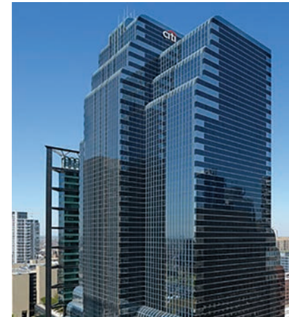
500 West Madison Chicago, Illinois