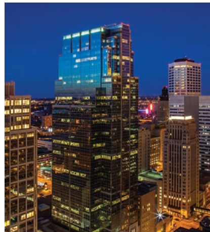
RBC Plaza Minneapolis, Minnesota