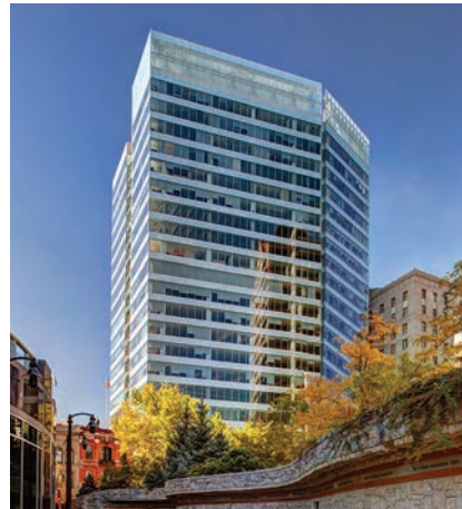
222 Main Salt Lake City, Utah

not only where you do business that matters, but how you do business. Our "hands-on" approach has led us to many successes, gaining us profound trust with our clients. At KBS, we believe our people are our greatest asset and our tireless efforts to conduct good business has not only earned us repeat investment opportunities, but also formed long lasting relationships.