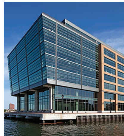
Thames Street Wharf Baltimore, Maryland