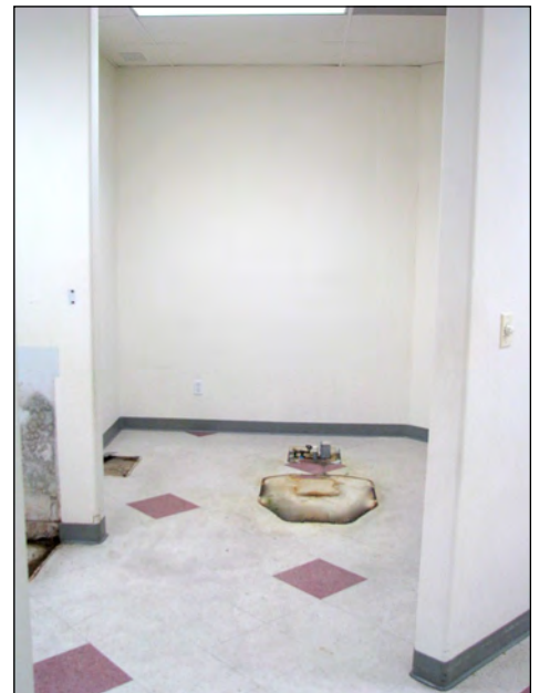
Interior Spaces—Office and Divided Areas

MEACHAM/OPPENHEIMER, INC. CORFAC INTERNATIONAL 8 No. San Pedro St., Suite 300 San Jose, California 95110 Tel: 408.378.5900 www.moinc.net