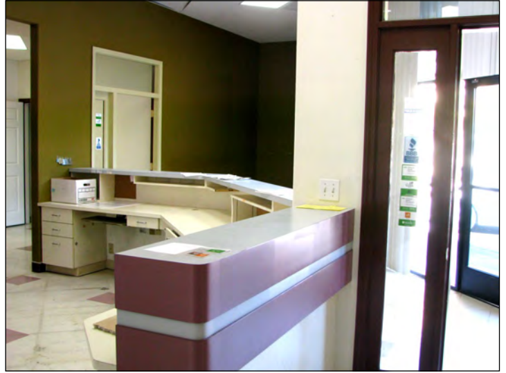
Front Reception Area