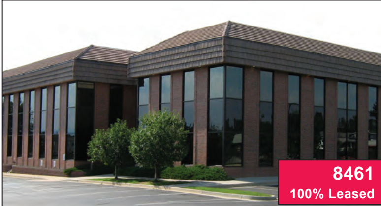
8461 100% Leased