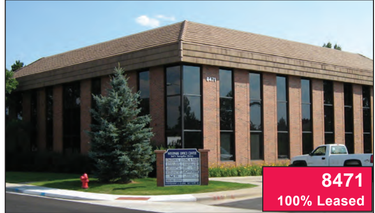
8471 100% Leased