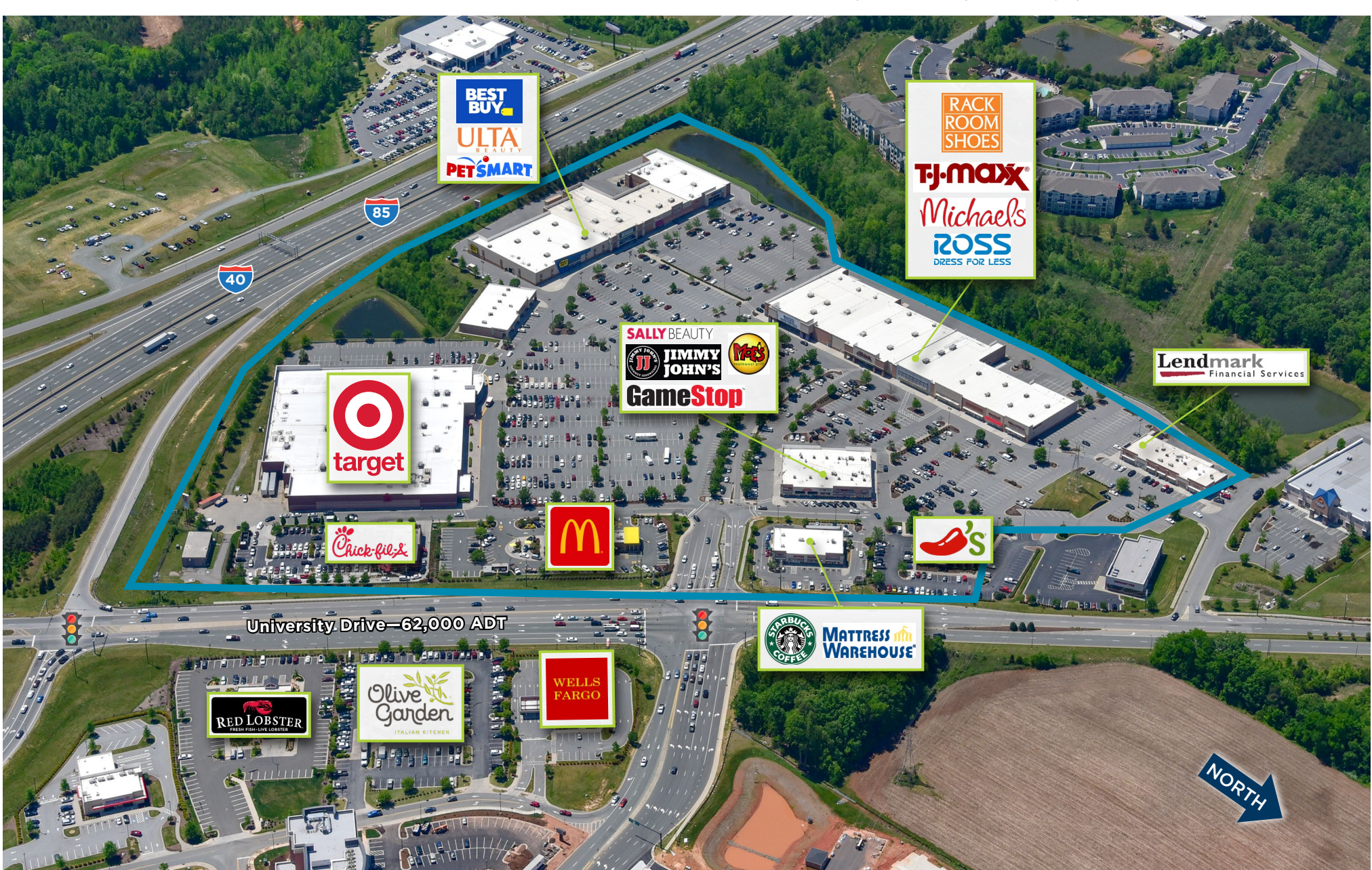
University Commons is a joint venture project of CASTO and Skilken