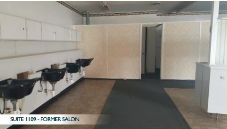
SUITE 1109 - FORMER SALON

W. BRAEWICK DR. & N. BUTLER AVE., MARION, IN 46952 | FOR SALE