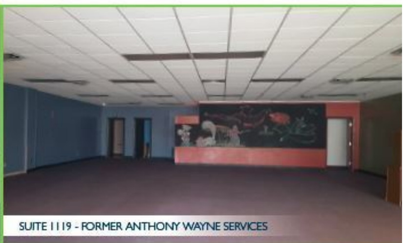
SUITE 1119 - FORMER ANTHONY WAYNE SERVICES