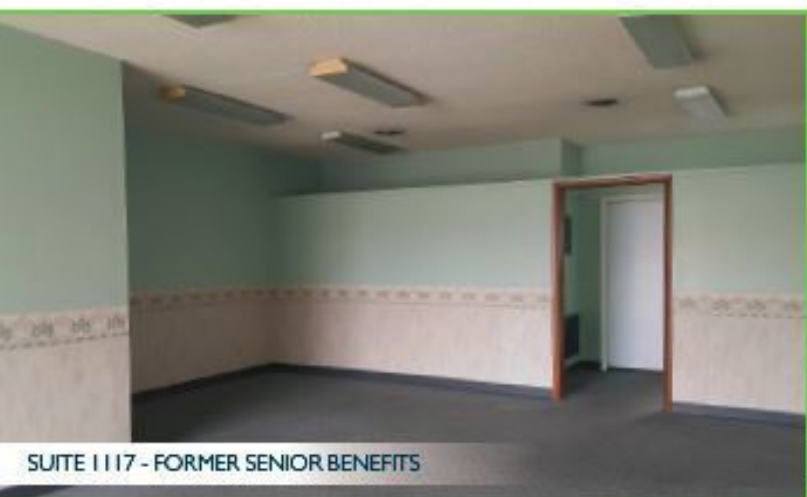
SUITE 1117 - FORMER SENIOR BENEFITS