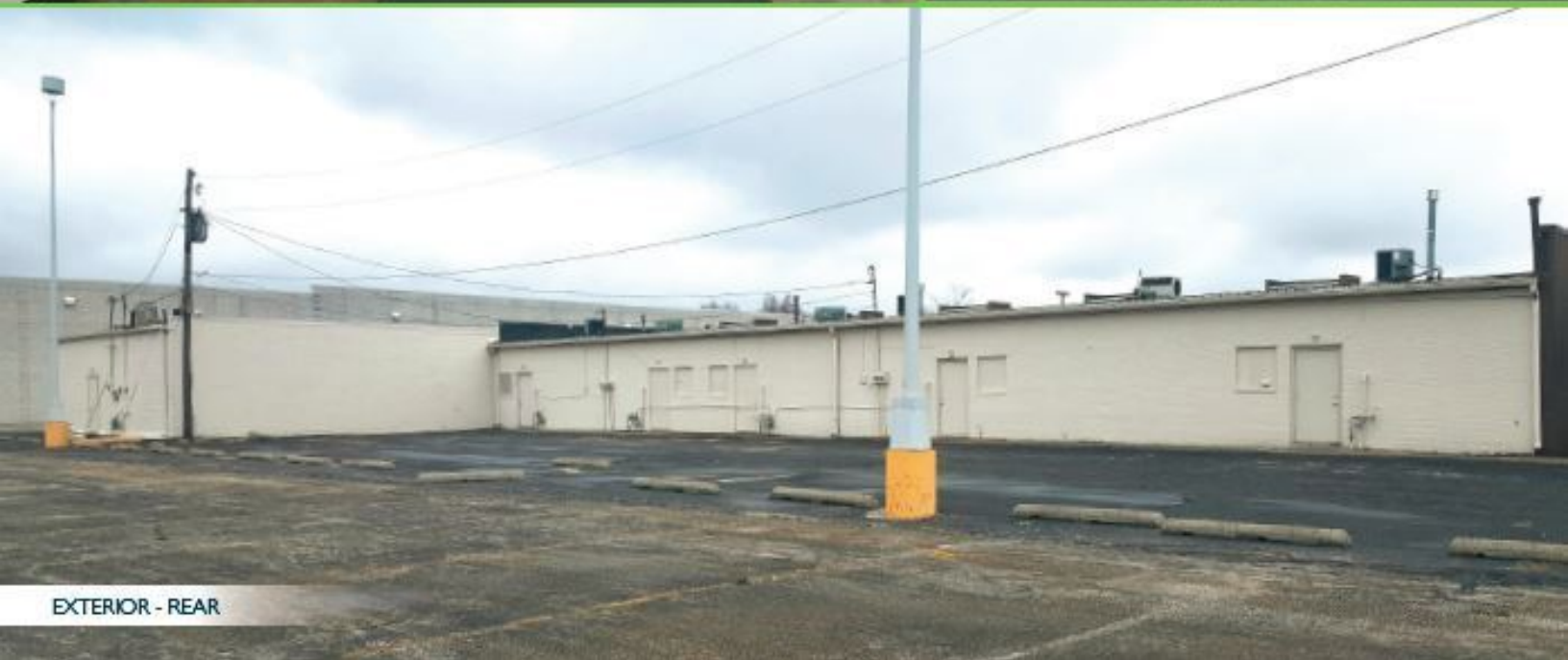
EXTERIOR - REAR