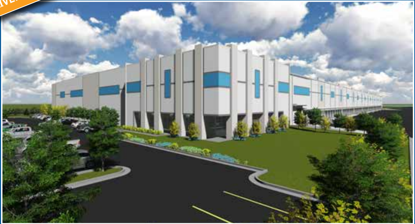
HIGHWAY 42 AND KING MILL ROAD, MCDONOUGH, GEORGIA