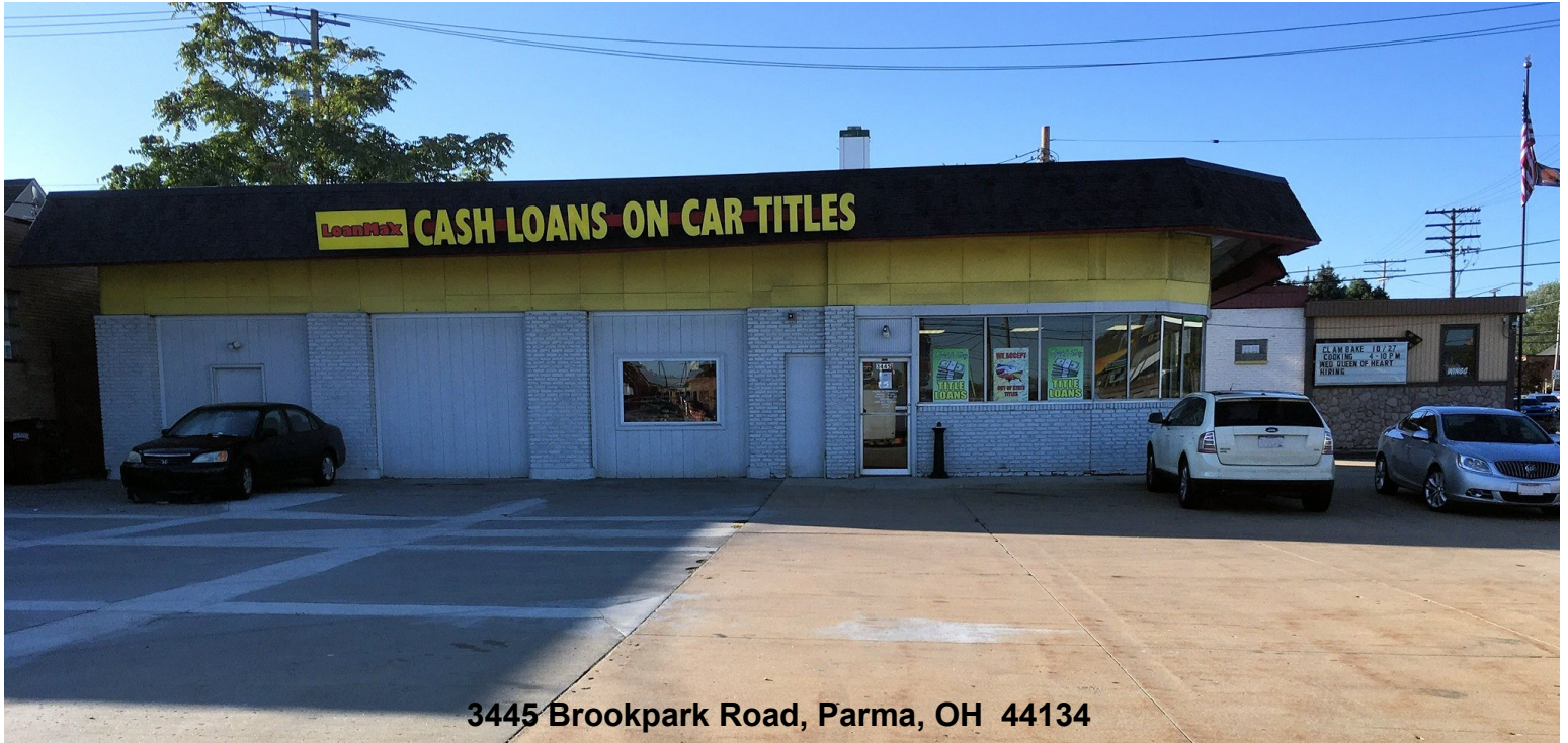
3445 Brookpark Road, Parma, OH 44134