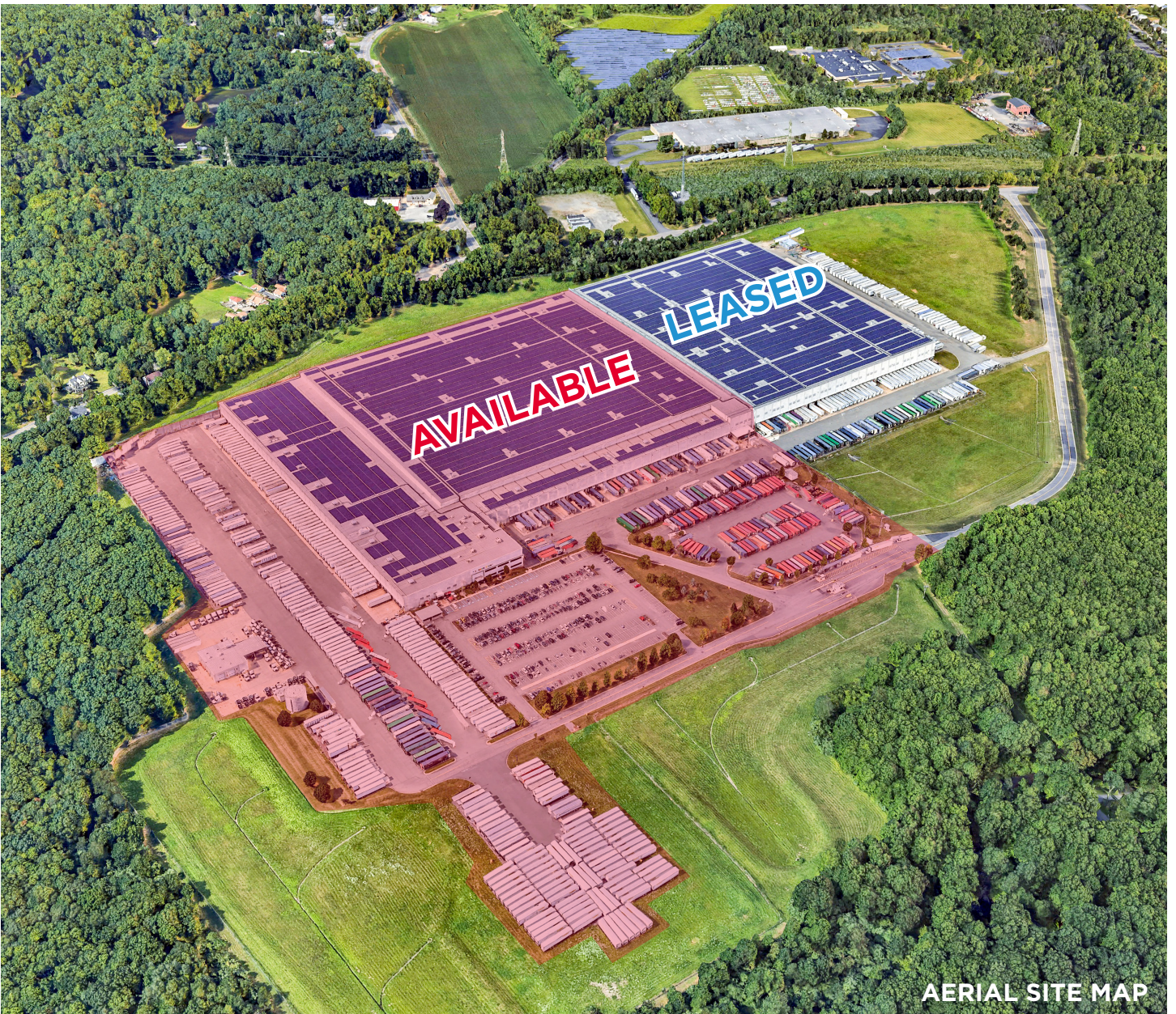
AERIAL SITE MAP