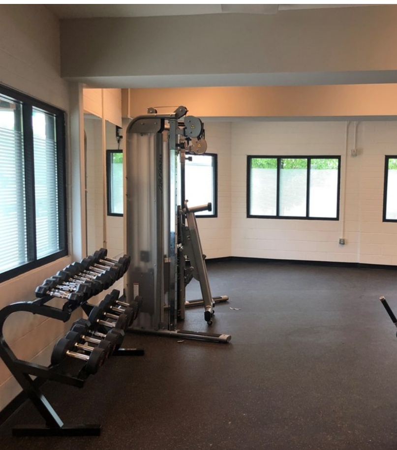
550 Michigan Ave