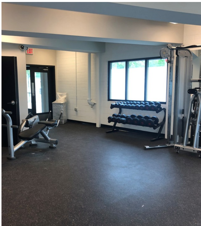
550 Michigan Ave