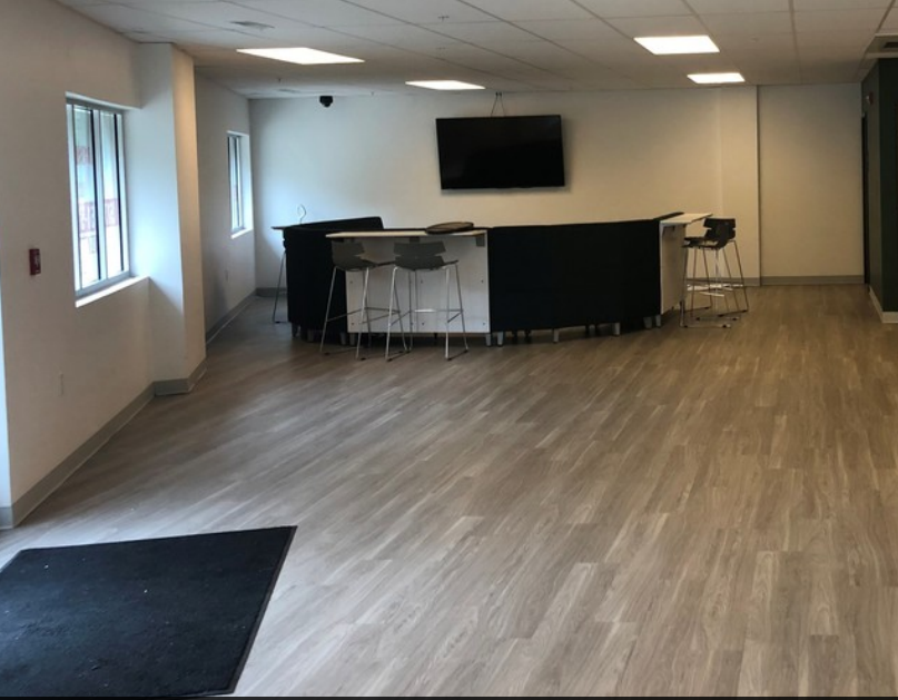
500 Michigan Ave