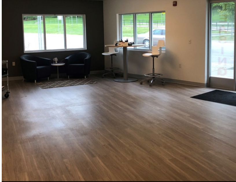
500 Michigan Ave