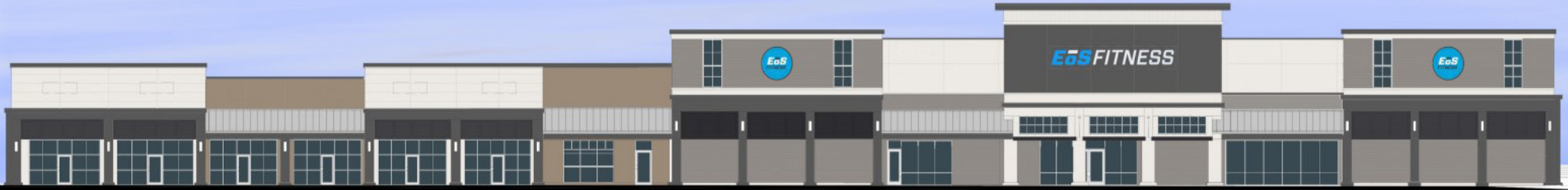
Front Elevation Upon Redevelopment