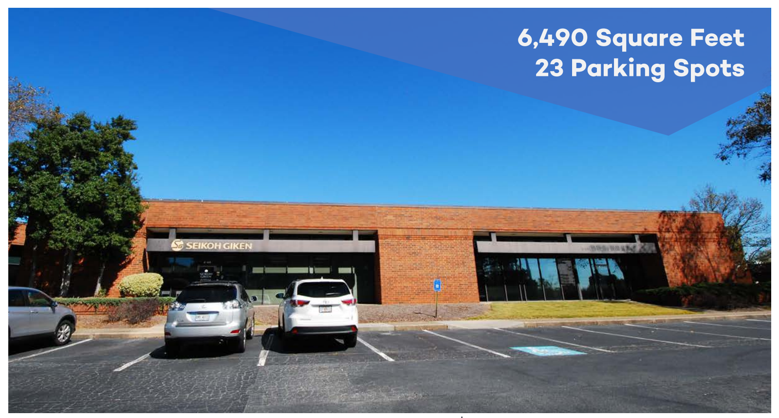
4405 International Boulevard, Suite 102 Norcross, Georgia 30093 Gwinnett Park - Northeast Atlanta