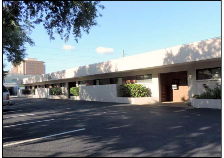
VIEW FROM 12 th ST