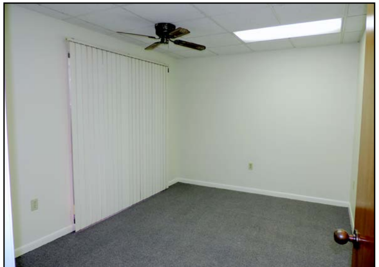
TYPICAL INTERIOR OFFICE