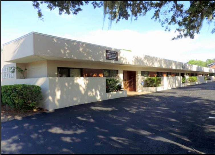
VIEW FROM 9 th AVE W