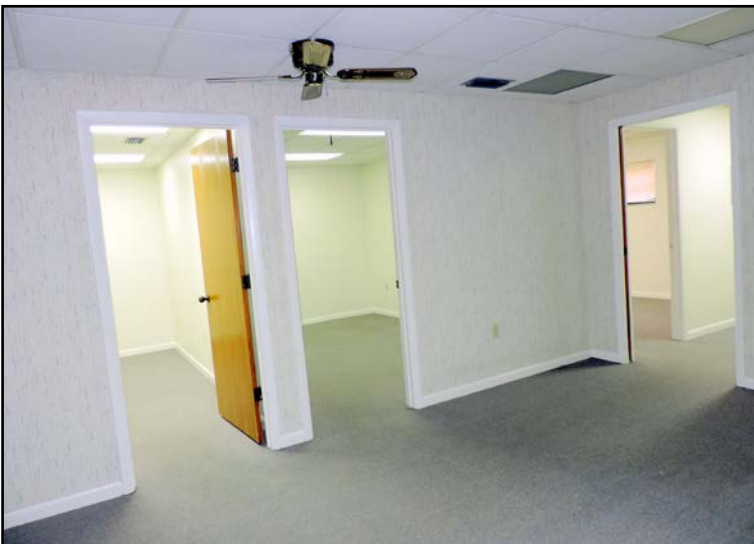
RECEPTION AREA & OFFICES