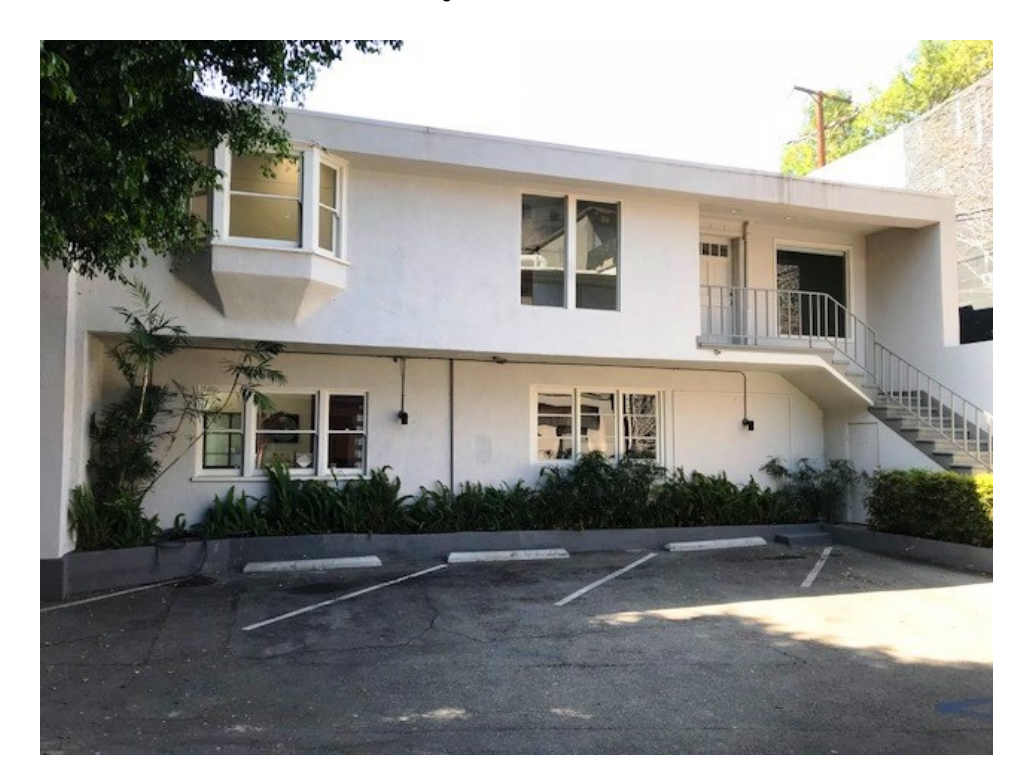
1,600 Sq. Ft. Office

Convenient small office on second floor of building behind 8670 Melrose Avenue directly across the street from The Pacific Design Center