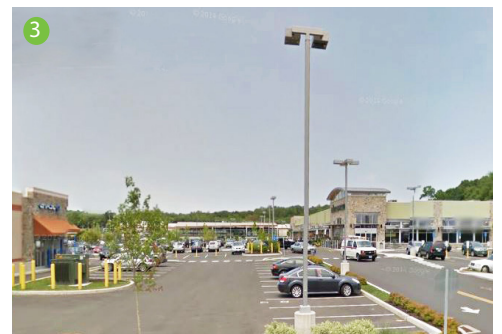
Kings Crossing Shopping Center