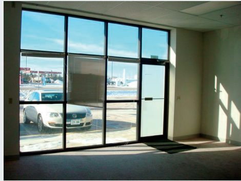
Front Windows and Entry Door

For Lease 2319-2325 Neva Road Antigo, WI 54409