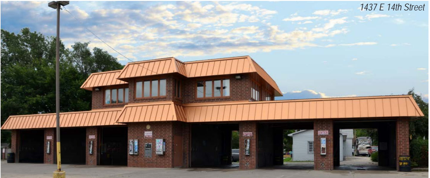
1437 E 14th Street