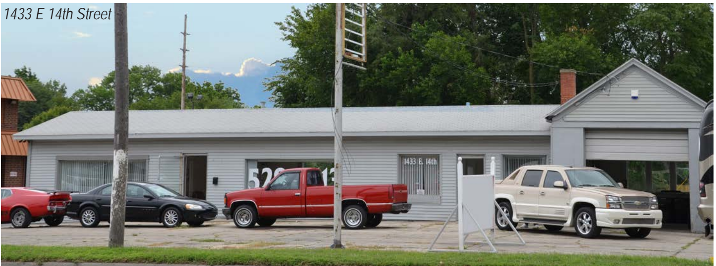
1433 E 14th Street