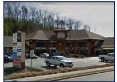
Site is across street from Columbus Commons Retail Center