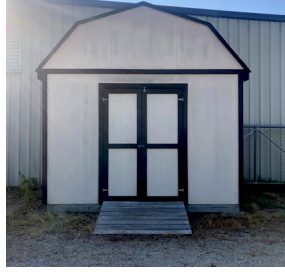
*The land acreage and/or building square footage was obtained from the County's Geographical Information System or other electronic resources. For exact square footage and/or acreage, we recommend that prior to purchase, a prospective Buyer/Tenant obtain a boundary survey or have the building measured professionally.