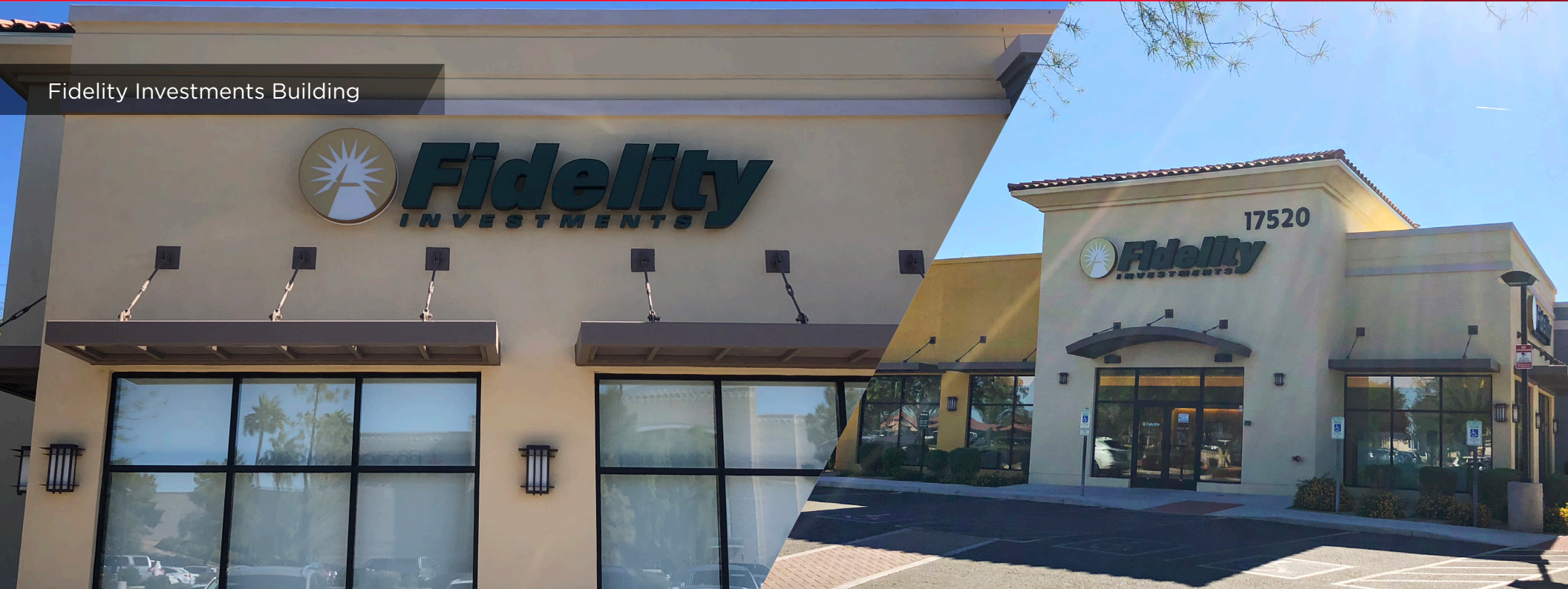
Fidelity Investments Building