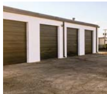
Grade Level Loading