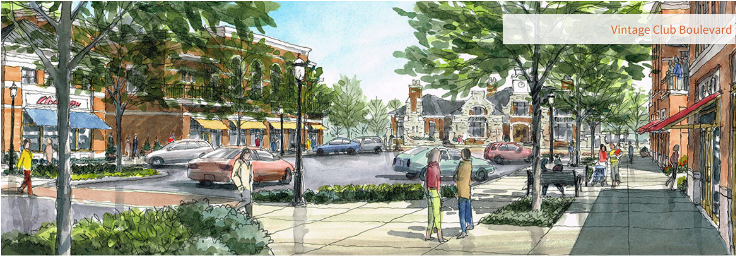
Vintage Club Boulevard