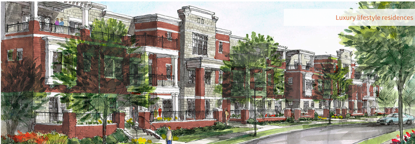
Luxury lifestyle residences