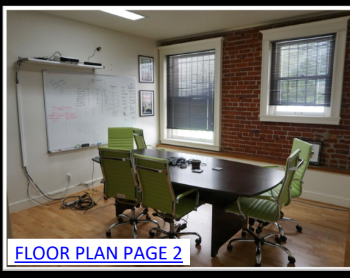
FLOOR PLAN PAGE 2

Represented by: Matt Gondak 510-450-1434 mgondak@mrecommercial.com CA BRE License: 00832220 www.mrecommercial.com